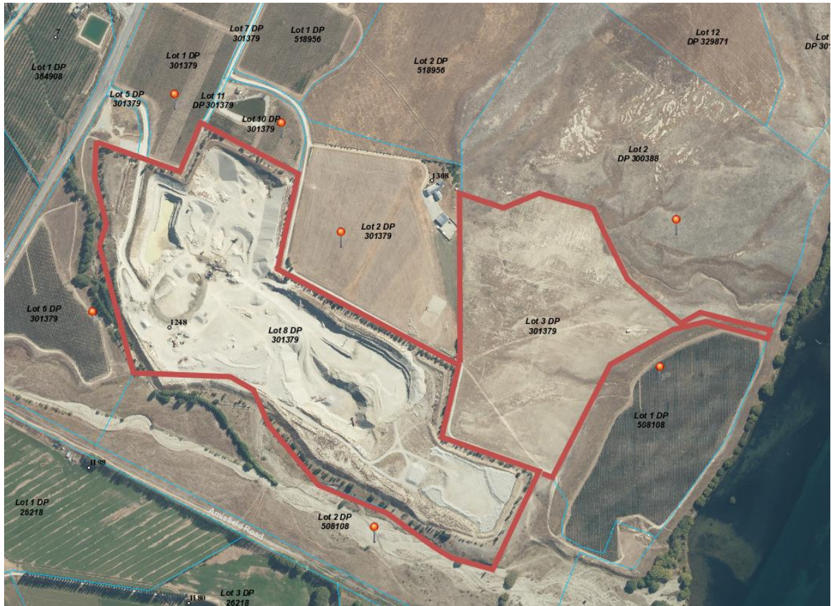
Figure 2. Location of affected parties affected by adverse dust effects (shown as red points). The property the activity relates to is shown in red.