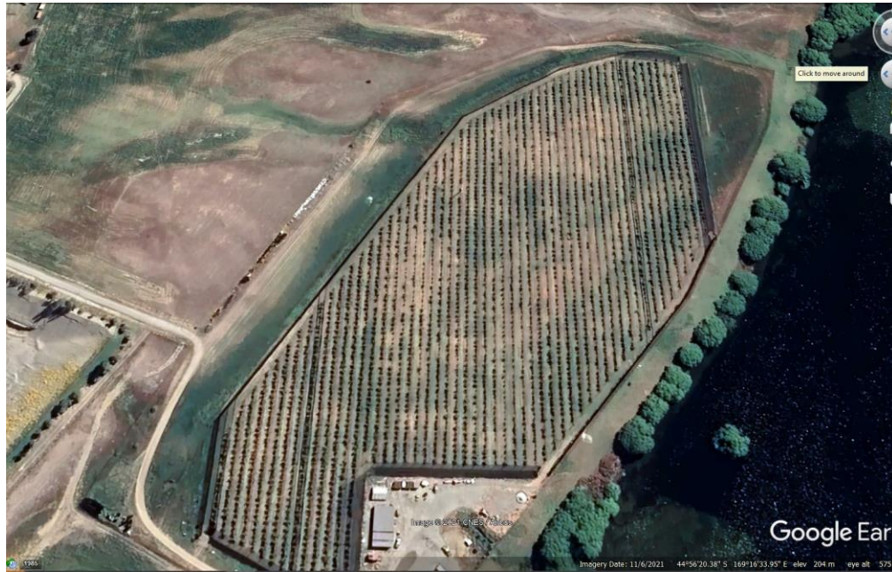
Figure 2: Aerial view of 'Little' east orchard site in November 2021 from Google Earth, suggesting correlation of areas of poor tree establishment with soil differences visible in the 2005 aerial view.

7.10 Regarding the site to the immediate south of the quarry (owned by Hayden Little Family Trust), the increase in boundary to the cherry orchard with the proposed quarry expansion is modest. From viewing Google Earth aerial view of imagery from 6 th November 2021, the rows appear to be orientated east to west with no external shelter trees (Figure 3 below). The east end of the orchard is adjacent to 'bare' streambed of the Amisfield Burn. There is a very incomplete shelter tree row on the south edge of the existing quarry to the north edge of the orchard, especially at the east end of the orchard.