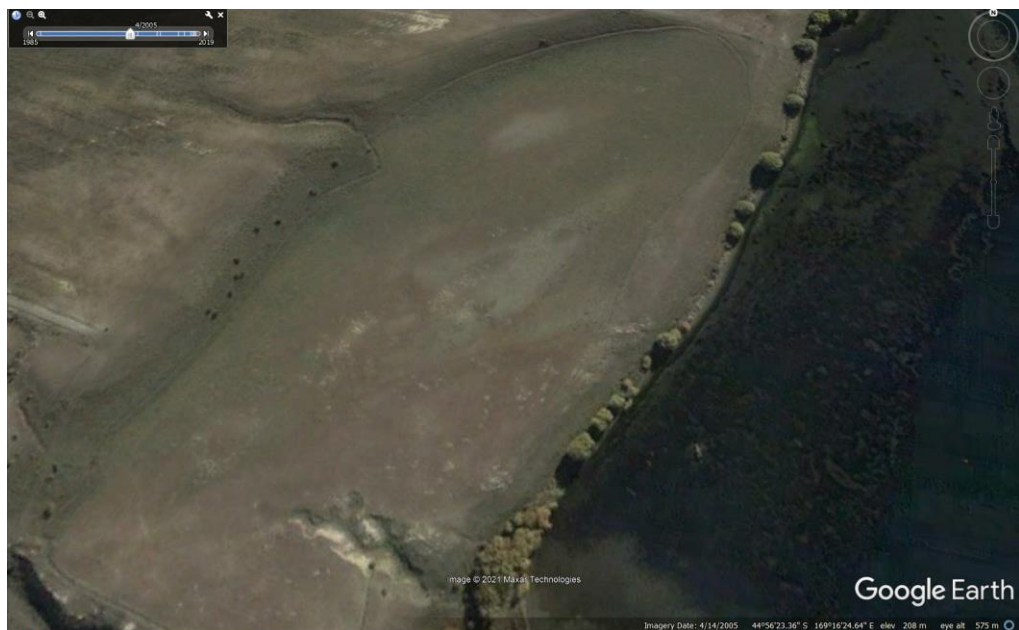
Figure 1: Aerial view of 'Little' east orchard site in 2005 from Google Earth.