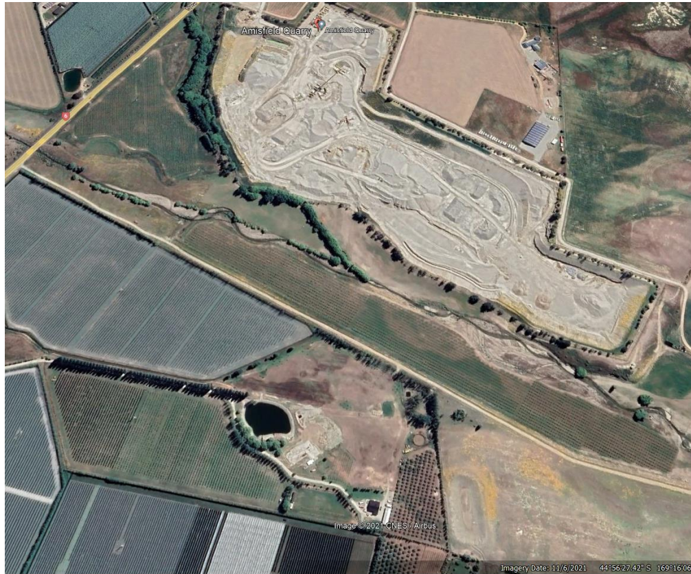
Figure 3: Aerial view from Google Earth - imagery dated 6 November 2021. The 'Little' southern cherry orchard is the long piece of land between the Amisfield Burn stream and Amisfield Road to the south of the existing quarry. North is at the top of the picture.

7.11 The Amisfield Orchard property to the immediate east of the proposed quarry expansion area has rows orientated north-south and appears to have boundary shelter, although it is not clear from the recent Google Earth view how much is trees. It appears likely that most of the shelter is artificial cloth shelters except on the east edge nearest to Lake Dunstan where the shelter appears to be trees. Shelter trees between the quarry and orchards and around the orchards would contribute to dust suppression although I note that Mr Cudmore does not support these given his experience that large shelterbelts can collect dust from a wide area and discharge it in a plume in strong wind.