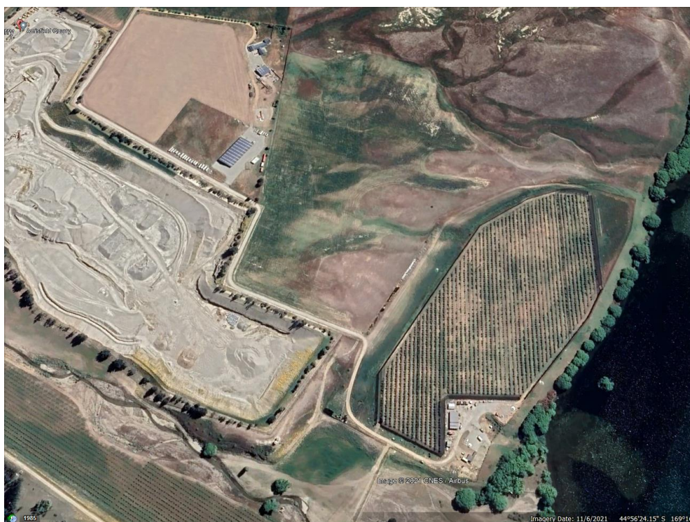
Figure 4: Aerial view from Google Earth - imagery dated 6 November 2021. The 'Little' eastern cherry orchard is the piece of land between the existing quarry and Lake Dunstan, with the proposed quarry expansion site immediately to the west of the orchard at the north-east of the existing quarry. North is at the top of the picture.

to the 'Little' eastern orchard based on the three-year average of data in Mr Cudmore's modelling, although there were some winds directly from the north during 2020 which could have blown dust into the orchard from the quarry expansion site. I understand that continuous and real time dust and wind monitors are proposed to be used as part of the dust management approach, particularly when excavating close to sensitive receptors such as the east orchard.