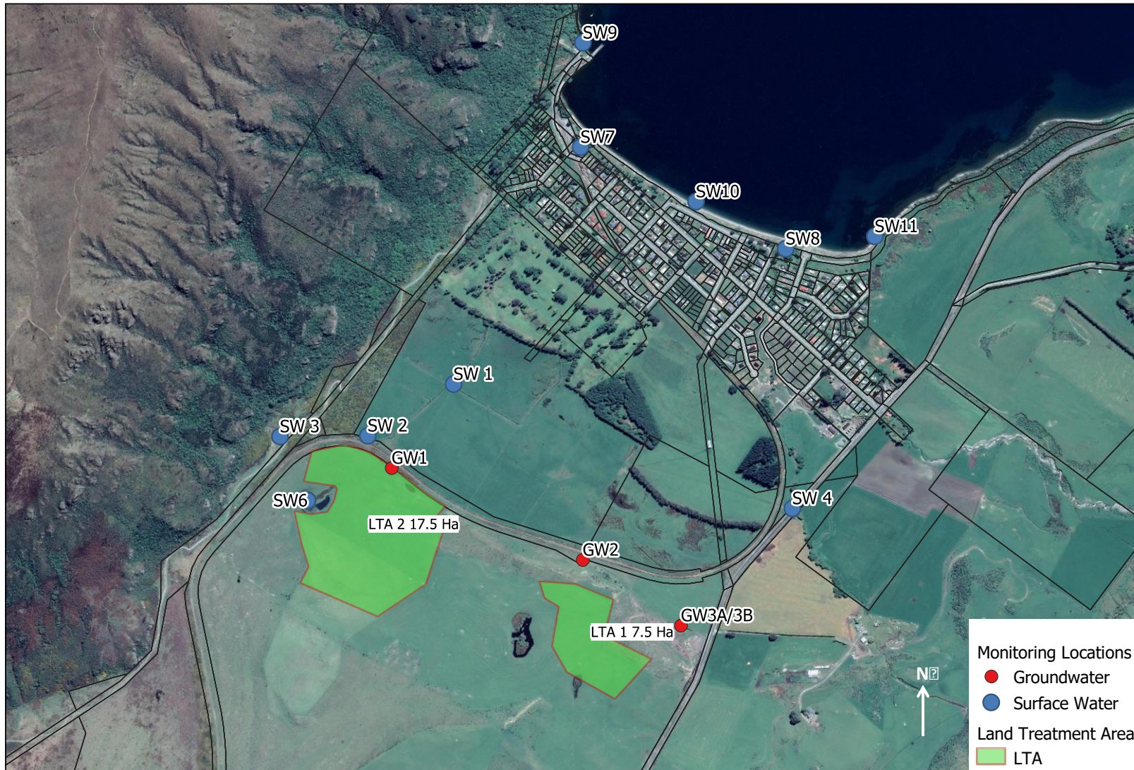
Figure 1. QLDC's proposed WWTP LTA (green highlighted areas) at Kingston Station (Site) and surface water quality sampling sites (blue circles).