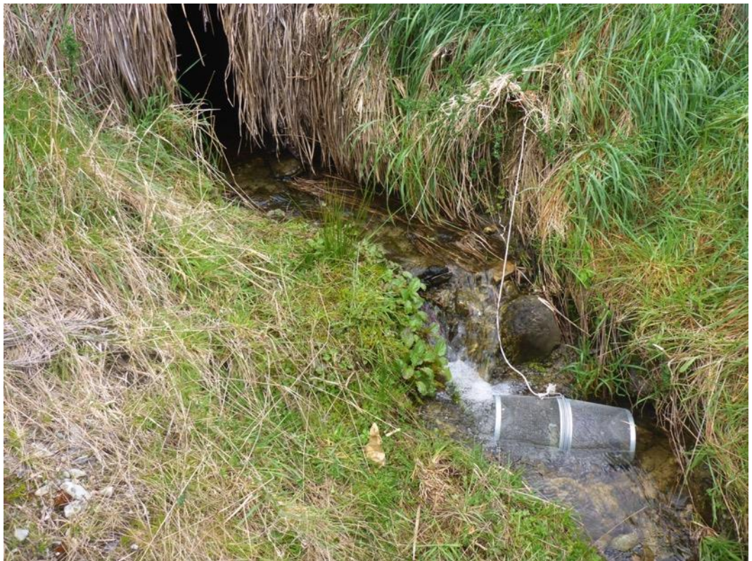
Figure 3. Unnamed tributary, SW3, October 2020.