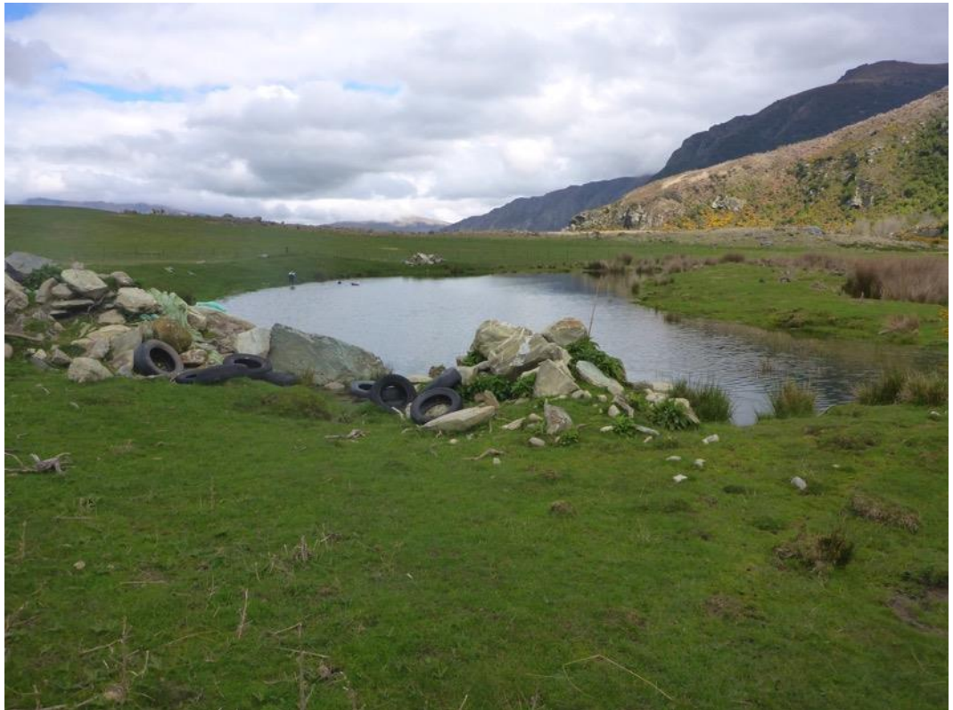
Figure 2. Pond, SW6, October 2020.