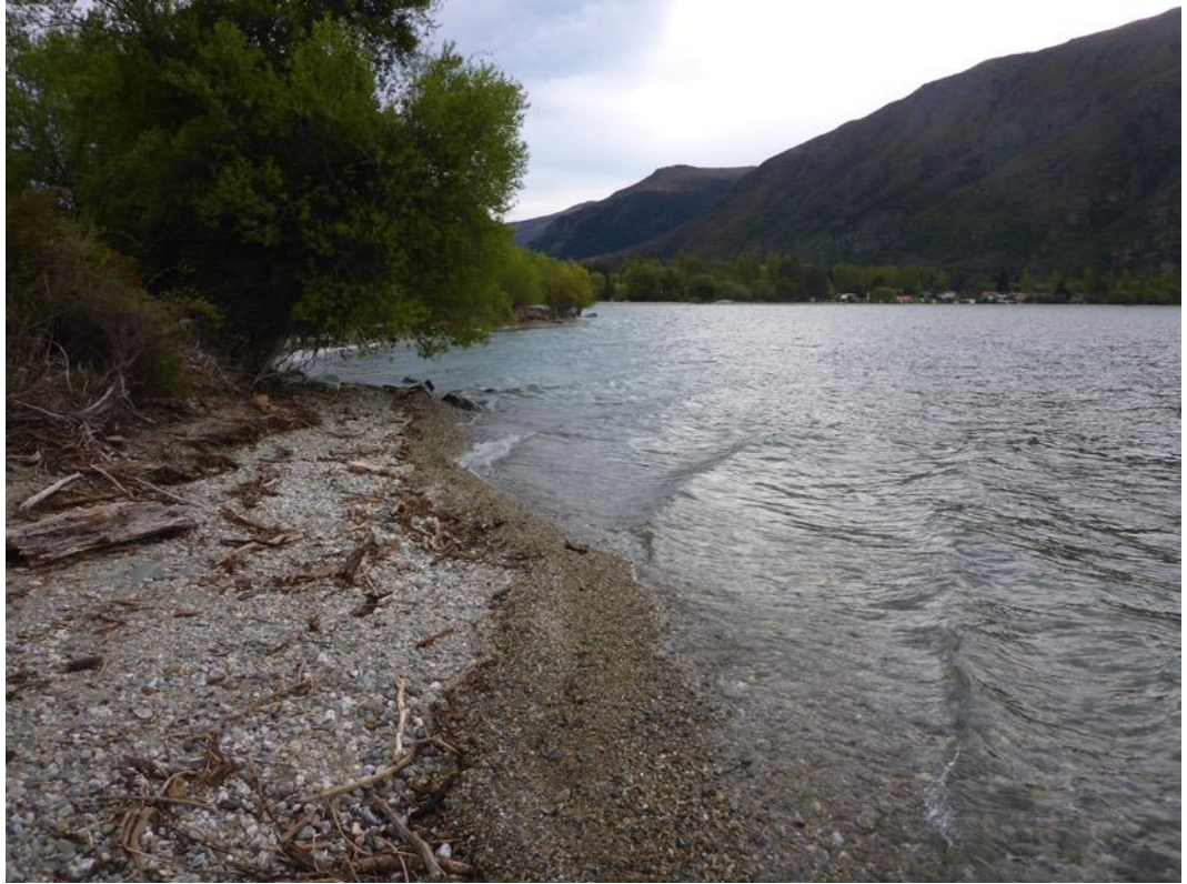
Figure 10. Lake Wakatipu, SW11, October 2020.