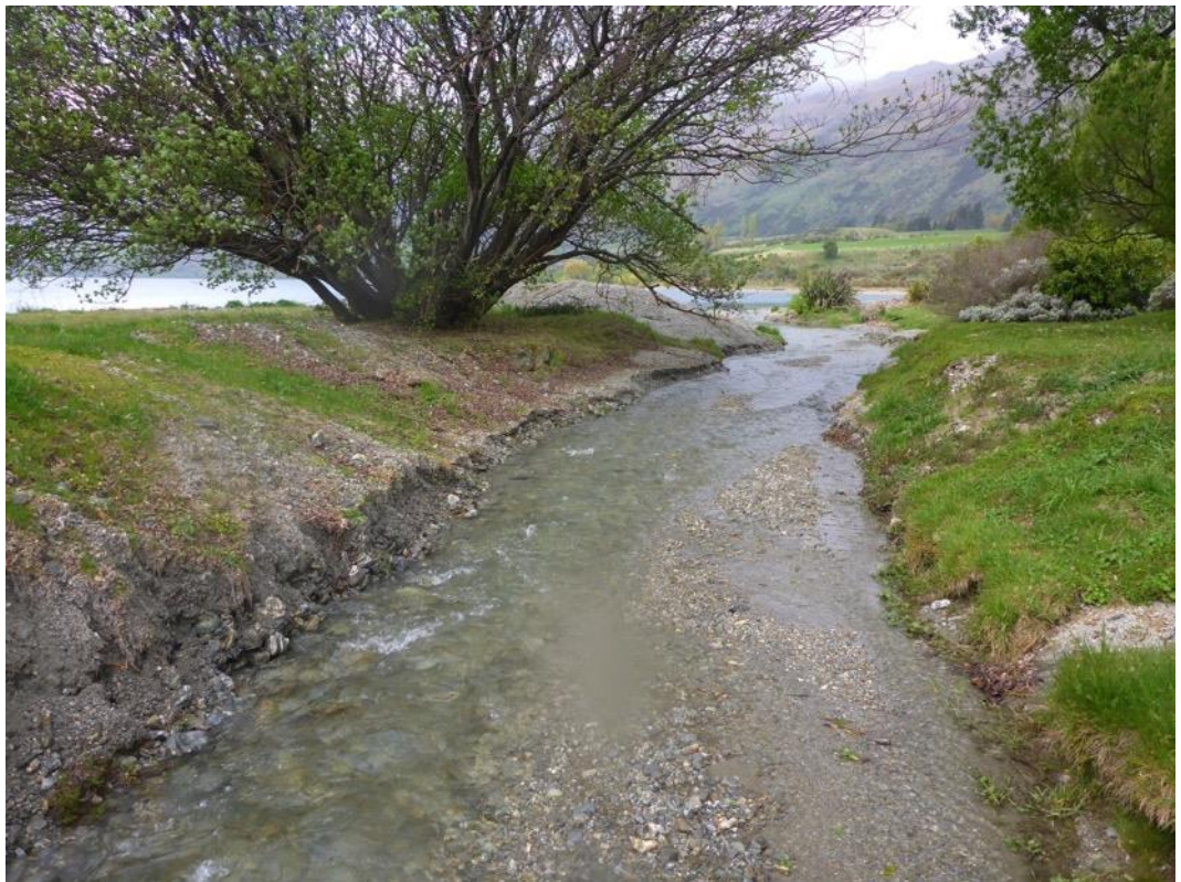
Figure 8. Kingston Creek, SW8, October 2020.