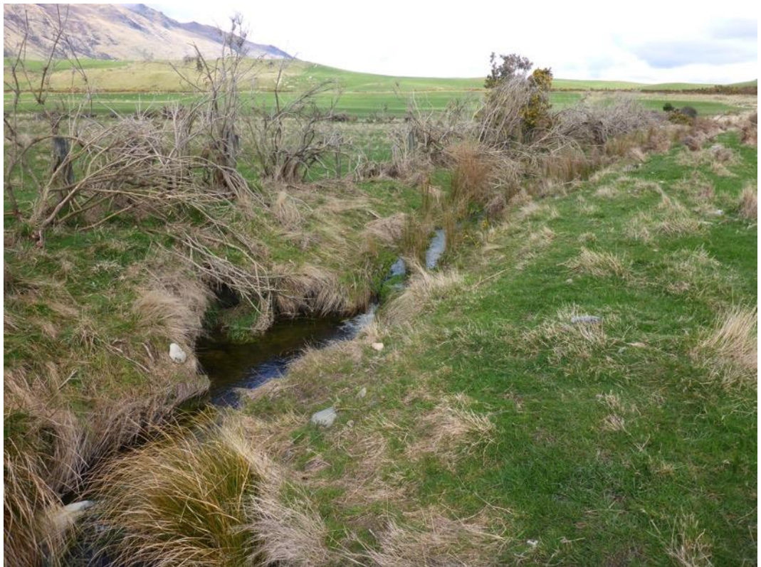
Figure 5. Unnamed tributary, SW1, October 2020.