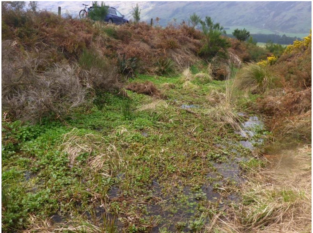
Figure 4. Unnamed tributary, SW2, October 2020.