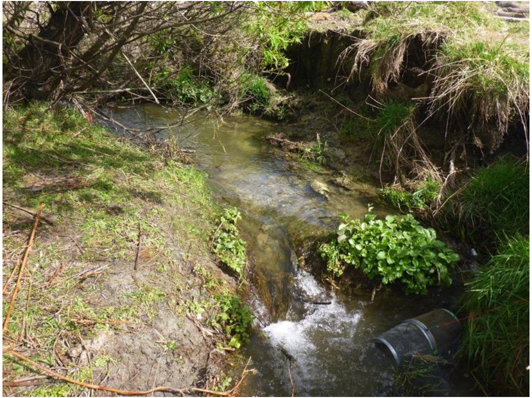
Figure 7. Kingston Creek tributary, SW4, October 2020.