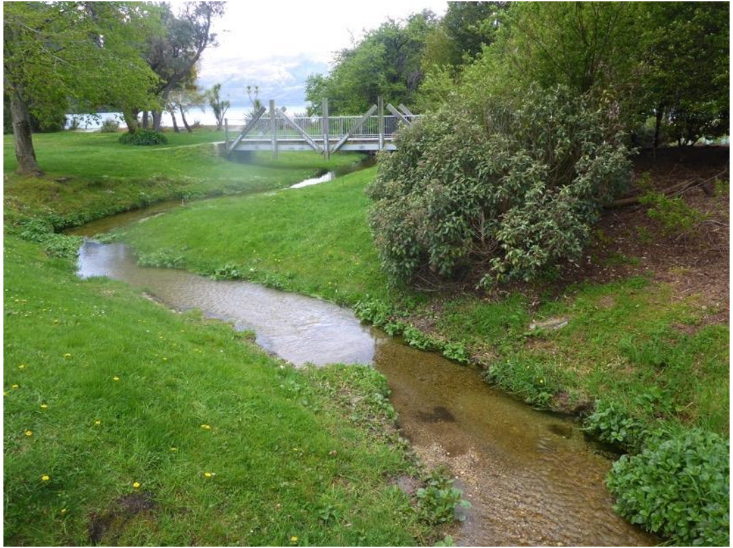
Figure 6. Unnamed tributary, SW7, October 2020.