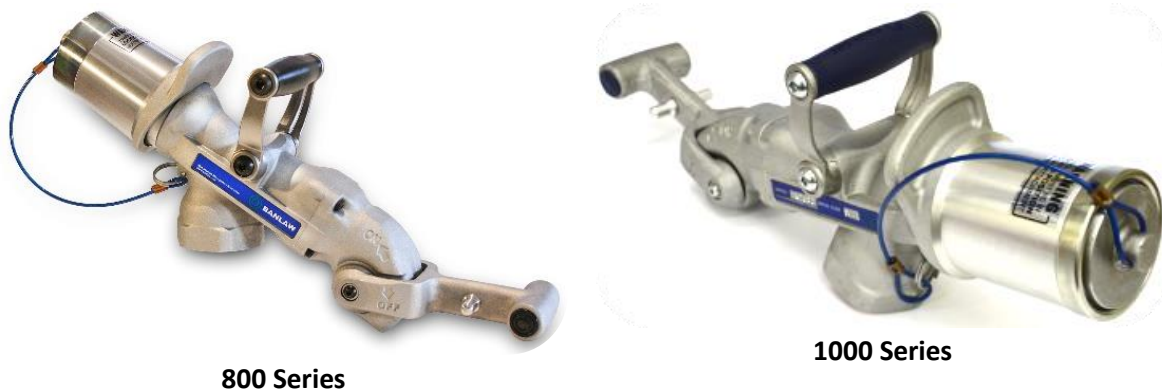
Figure 1 - Examples of Banlaw Nozzles

Banlaw introduced their first dry-break diesel refuelling nozzles into the market in the 1980’s in response to a requirement for a more ergonomic and robust “industry standard” nozzle rated for higher diesel flowrates.