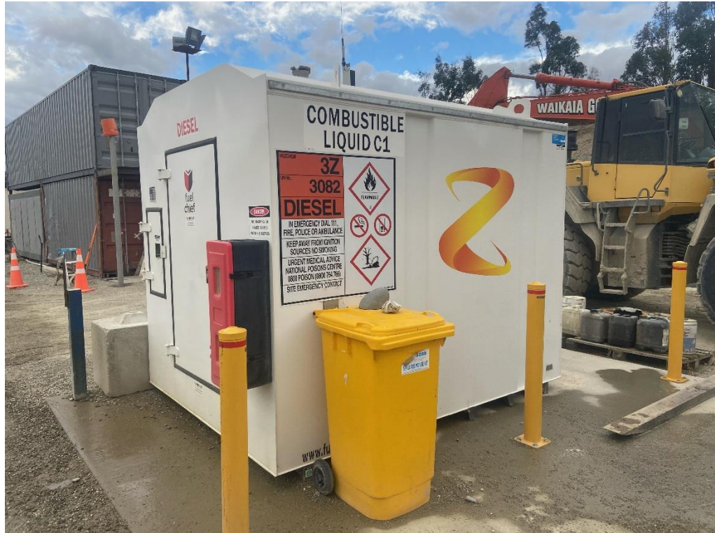
Figure 1: DC100 Enclosed Fuel Tank (Note: Spill kit is located in yellow bin in the foreground).