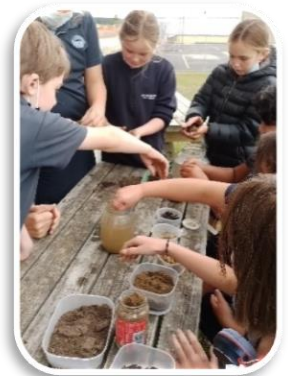
How healthy is our soil?

St. Joseph's (Oamaru) students have been designing robots to stop the red billed gulls / tarāpunga nesting on roofs in the downtown area of Oamaru. They are finding real solutions to the challenge of people and wildlife living together.