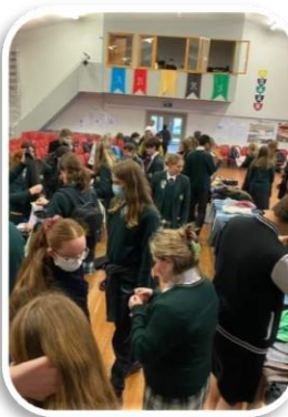
Bayfield students' clothes sale

are enabled to participate in a genuine way empowering them to become active environmental citizens for life and enriching the development of the whole school / centre environment.