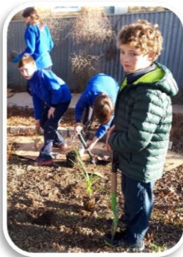
Alexandra Primary students planting their forest

Many schools are learning about their local environments and the things they can do to look after and enhance those environments. Alexandra Primary School have planted another 50 native trees at their school. There are few accessible