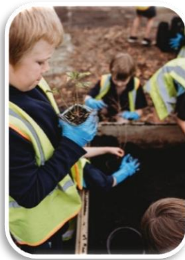
Waitaki Valley students potting native plants

Talk to your facilitator if you want to find out more about any of these stories or if you want support with sustainability learning and mahi at your school.