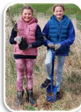
Waitahuna Students at their riparian planting site

Students are driving many of the sustainability initiatives at Bayfield High School . They organised their first Enviroweek this year. The whole school got involved in DIY workshops (seedbombs and wax wraps), a second-hand clothing sale and a pre-loved non-uniform day. There was a lunch time gig featuring Bayfield musicians with lighting managed by the technical students. On Friday there was a massive clean-up of the area.