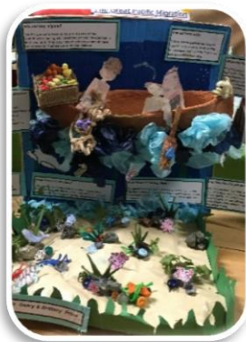
The Pacific migration story

Goldfields Primary School have been building on work from last year looking at local legends and evidence of the arrival of the first people in the area. This year they focused their inquiry on the journeys of Pacific people across Te Moana-nui-a-Kiwa since 900AD. Students learnt about the skills necessary to cross the Pacific Ocean, including star maps, bird migrations, wave patterns and seasonal winds. The students created displays for the local museum to share the things they had learnt with whanau and the community.