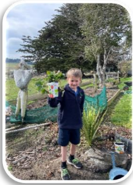
Waiwera South student with upcycled strawberry planter

Students are getting empowered around waste across the whole region. Green Island Primary School did a clean-up around their school and found lots of cardboard. The students are writing to the local businesses to remind them they can recycle cardboard. Queenstown Primary School students have organised waste-free Wednesdays and created a series of videos for the school newsletter with ideas for reducing lunch waste. They even show how waste free options are usually cheaper and healthier.