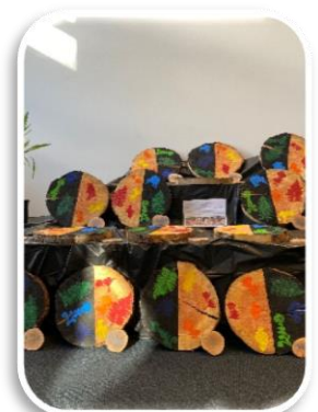
Hawea Flat students Matariki artwork