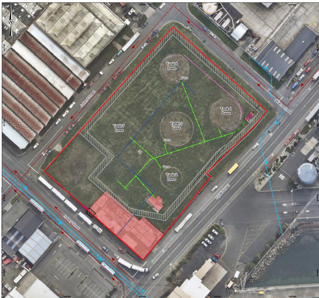
Figure 2 Aerial photograph of site showing locations of various elements remaining on site.

Adjacent land uses and owners are shown in Figure 3. These comprise a range of commercial and industrial land uses.