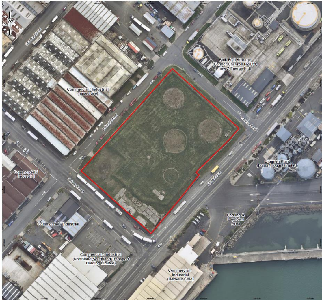
Figure 3 Adjacent land uses and owners. Site extent in red.