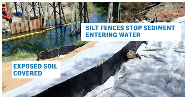
Covering exposed soils and setting up silt fences to stop sediment entering water is an effective way of both reducing erosion and retaining sediment on site.