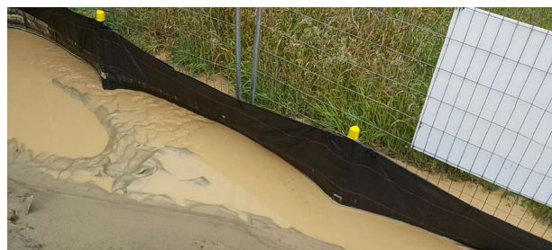
Monitoring to ensure that sediment that has been mobilised is not overwhelming the controls.