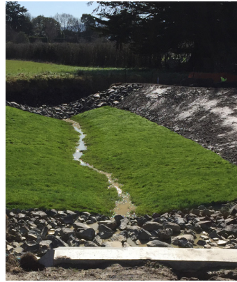
Artificial covers may be used to filter sediment and cover exposed soils.