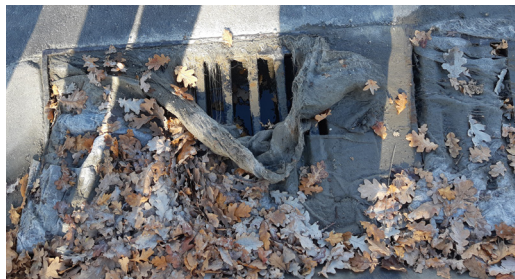
Sediment controls only work if they are regularly maintained: unfortunately filter sock has been moved and not put back in place