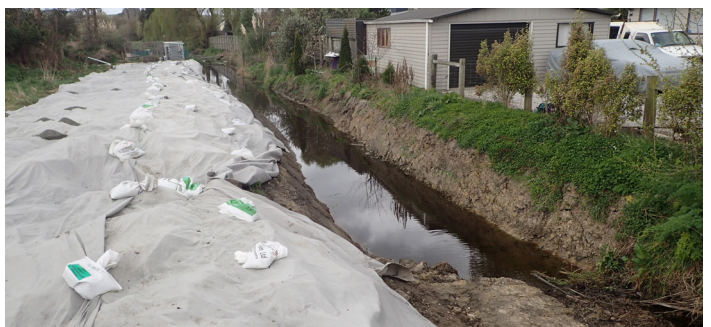
Good intentions to cover disturbed land, however no work has been done to manage sediment from the channel itself.

More information about our resource consent process is available at: