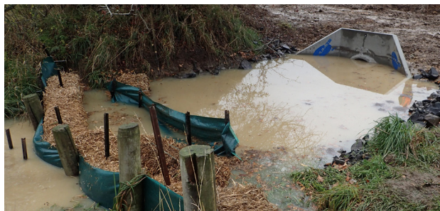
Water through this catchment has overwhelmed the sediment controls.