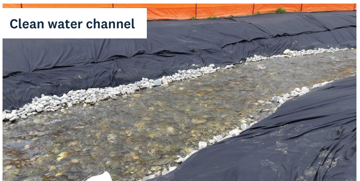
Pre existing waterways may be diverted through or around work sites. May need additional resource consent.