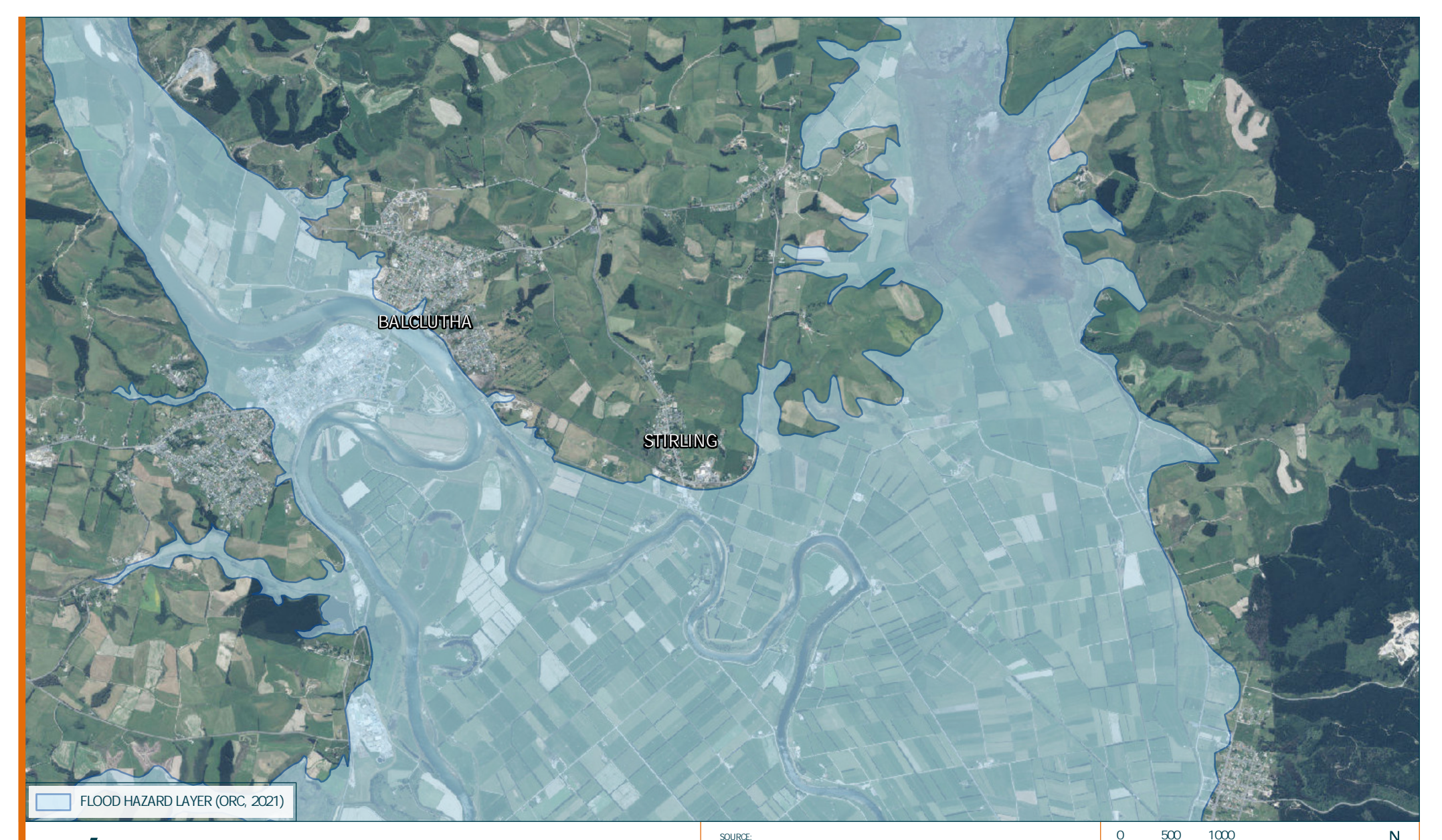
FIGURE 1: FLOOD PRONE LAND NEAR STIRLING