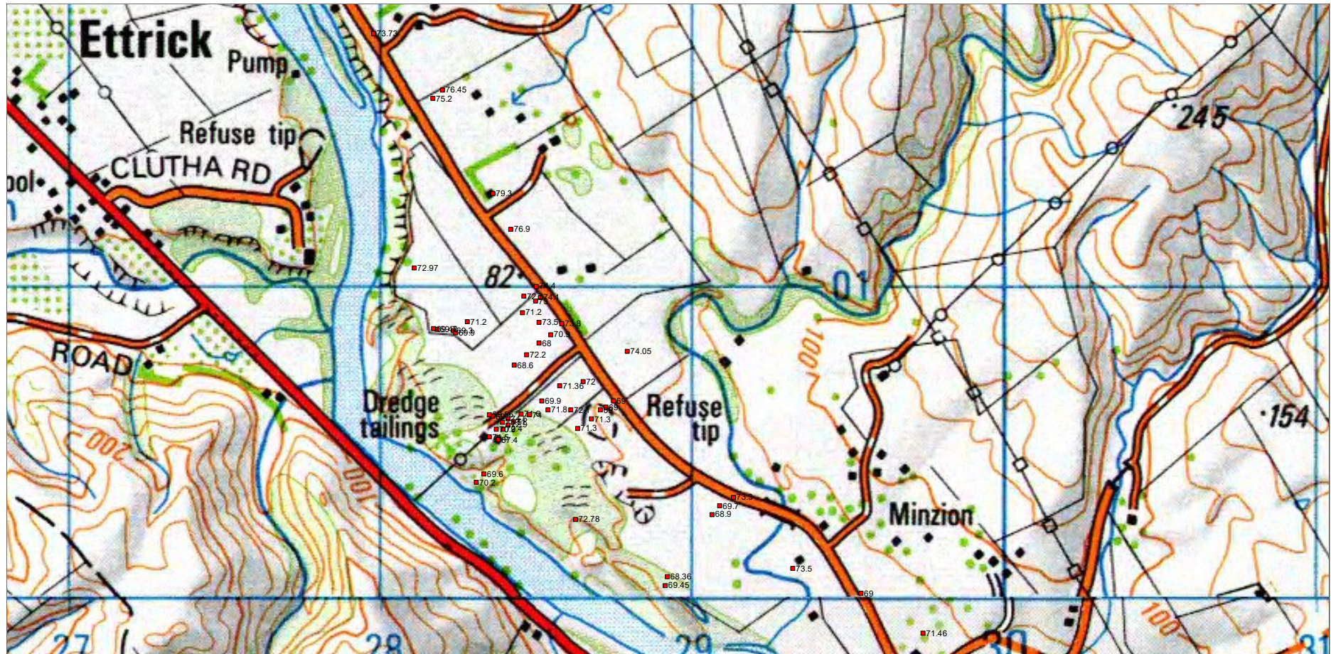
Relative Water Table Elevation (m)