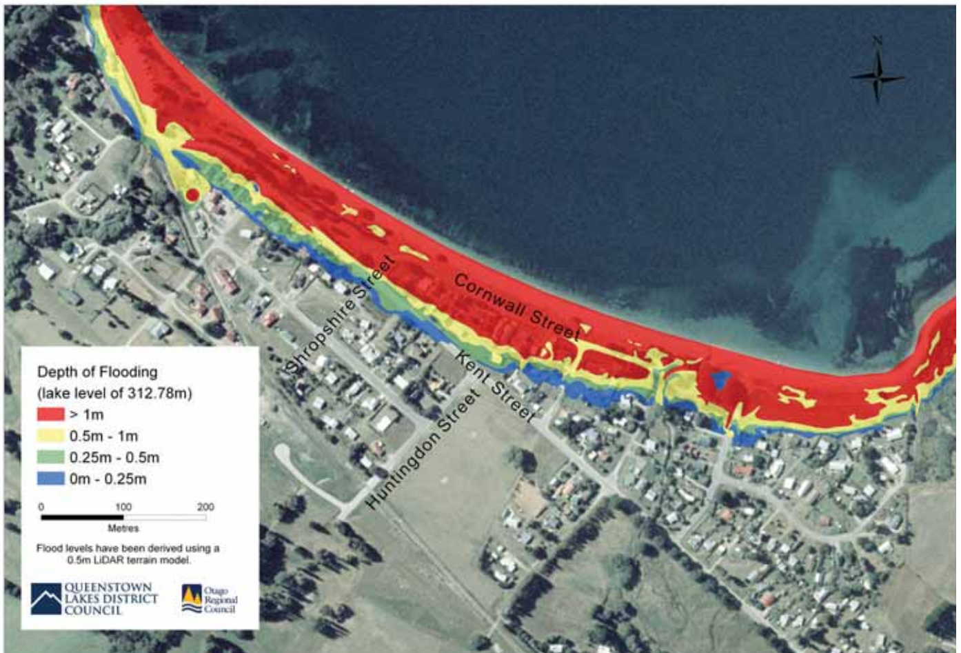
Figure 2. Depth of flooding at Kingston at a water level of 312.78m