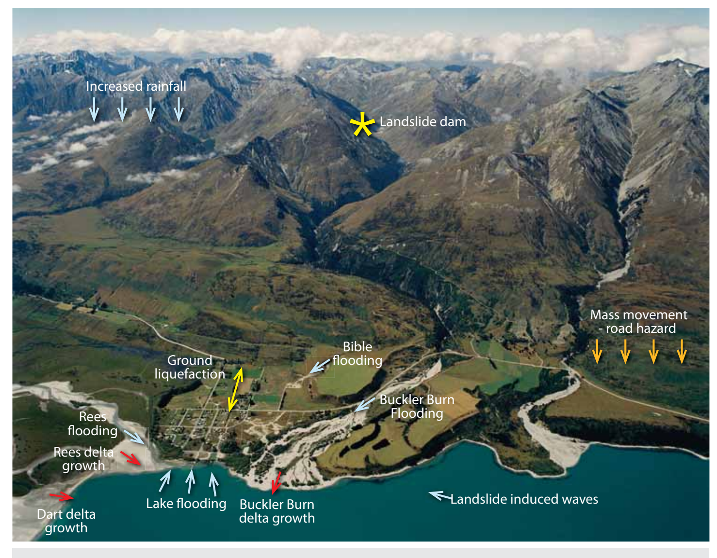
Figure 1: Glenorchy and its surrounding hazardscape.

Glenorchy's remote location, in a geologically active alpine area, raises the community's risk profile due to the potential for isolation. Further development within the township and future changes in climate will increase this risk. Therefore, Glenorchy's increasing population as well as the dynamic and changing nature of its surrounding environment, has prompted a study of these matters; to raise awareness of the community's vulnerability and to inform decision-making. The study is described in the document Natural Hazards at Glenorchy and is summarised here.