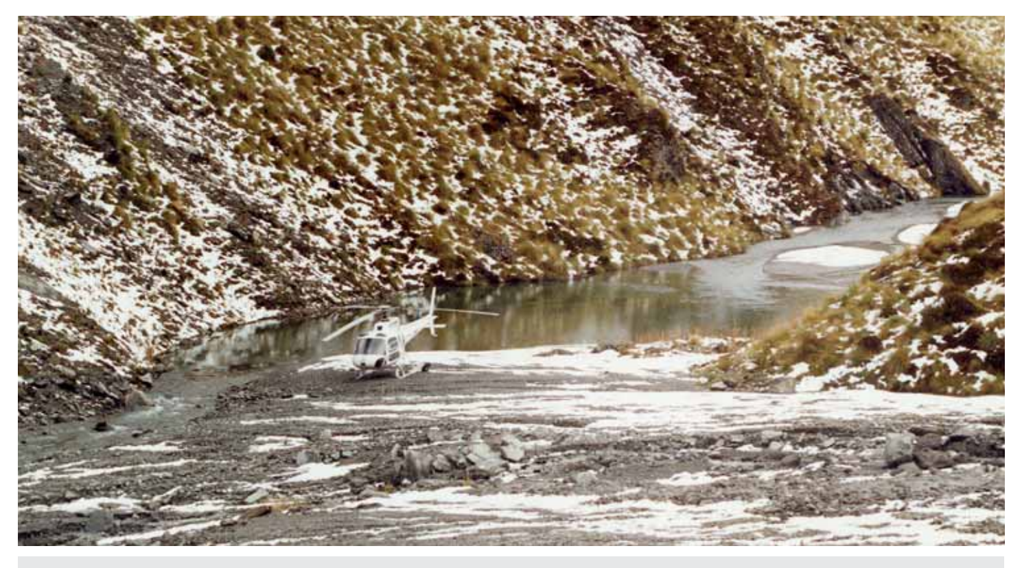
Figure 5: The Buckler Burn Landslide Dam in 2004 looking upstream.

Flooding from the Rees River, the Buckler Burn and the Bible Stream also have flood hazards that may impact Glenorchy. The Rees River and Buckler Burn deltas are steadily advancing into Lake Wakatipu. As these features continue to advance they are expected to combine into one large delta complex, raising the level of the river bed adjacent to Glenorchy and possibly causing the Rees River to alter its course towards the township. Also, large amounts of sediment from the Buckler Burn can raise its bed significantly (Figure 4) and could cause the channel to flow down the main road towards Glenorchy. A landslide dam in the upper Buckler Burn catchment (Figure 5) was discovered in 2004.