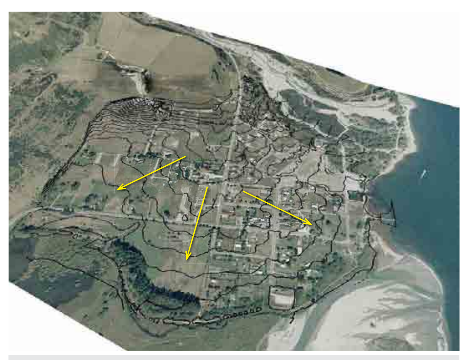
Figure 3: Digital Elevation Model and contour information representing the underlying topography of Glenorchy; yellow arrows indicate the slope of the land.