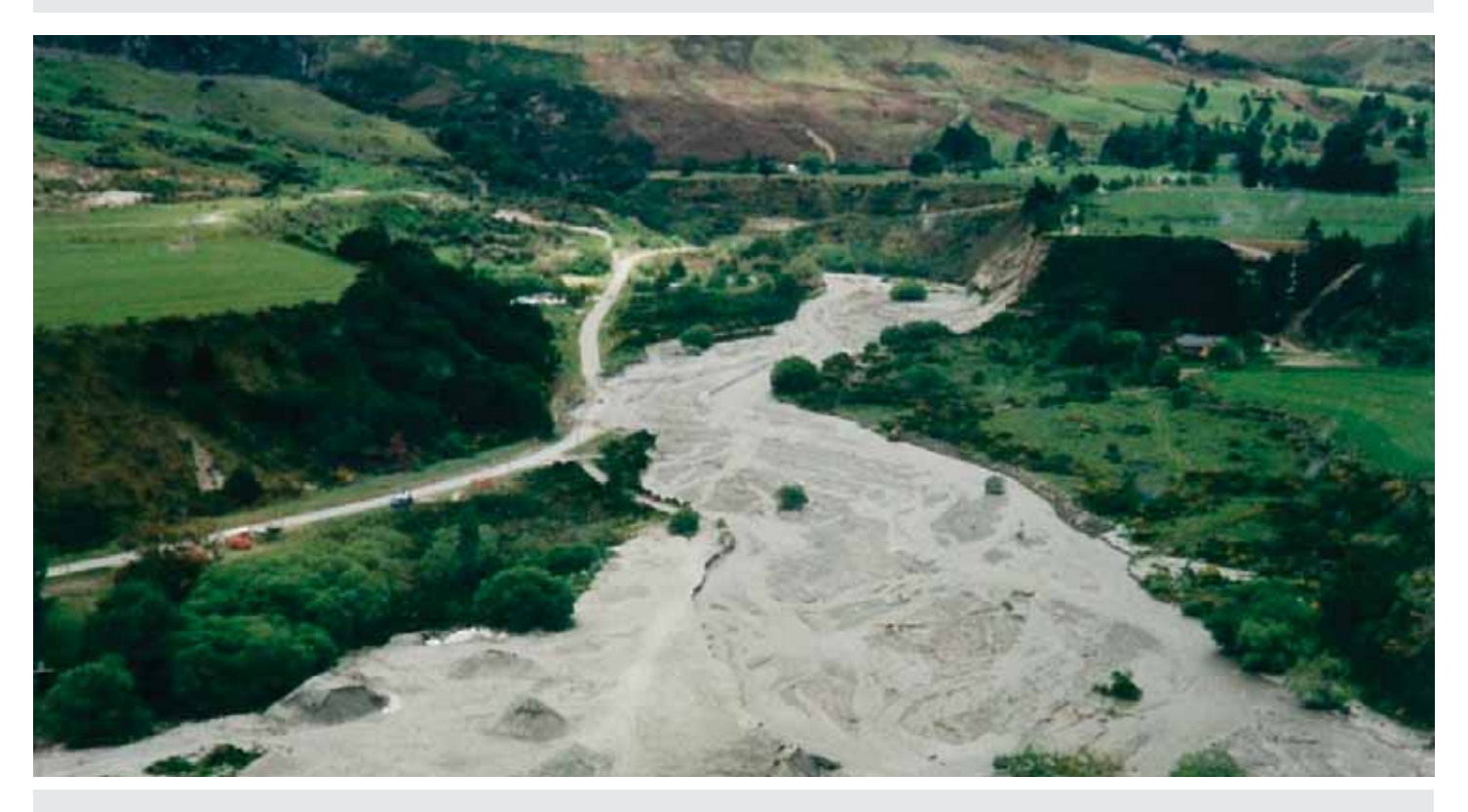
Figure 4: The lower Buckler Burn showing significant sedimentation following the November 1999 flood event.