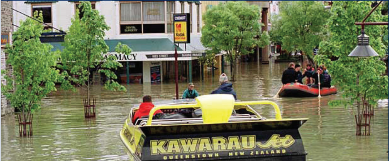
1999 Flood outside Wilkinson's Pharmacy