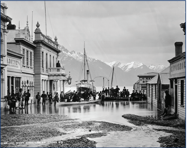
1878 Flood - 35 Ballarat St, Queenstown Sourced under a CC BY-SA 3.0 licence