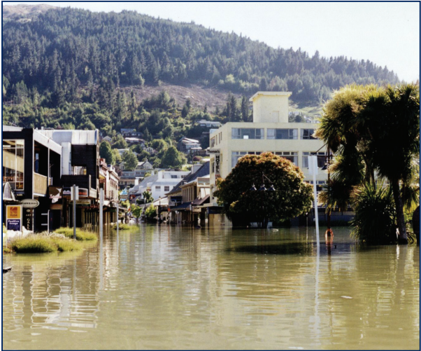
1999 Flood, Beach St