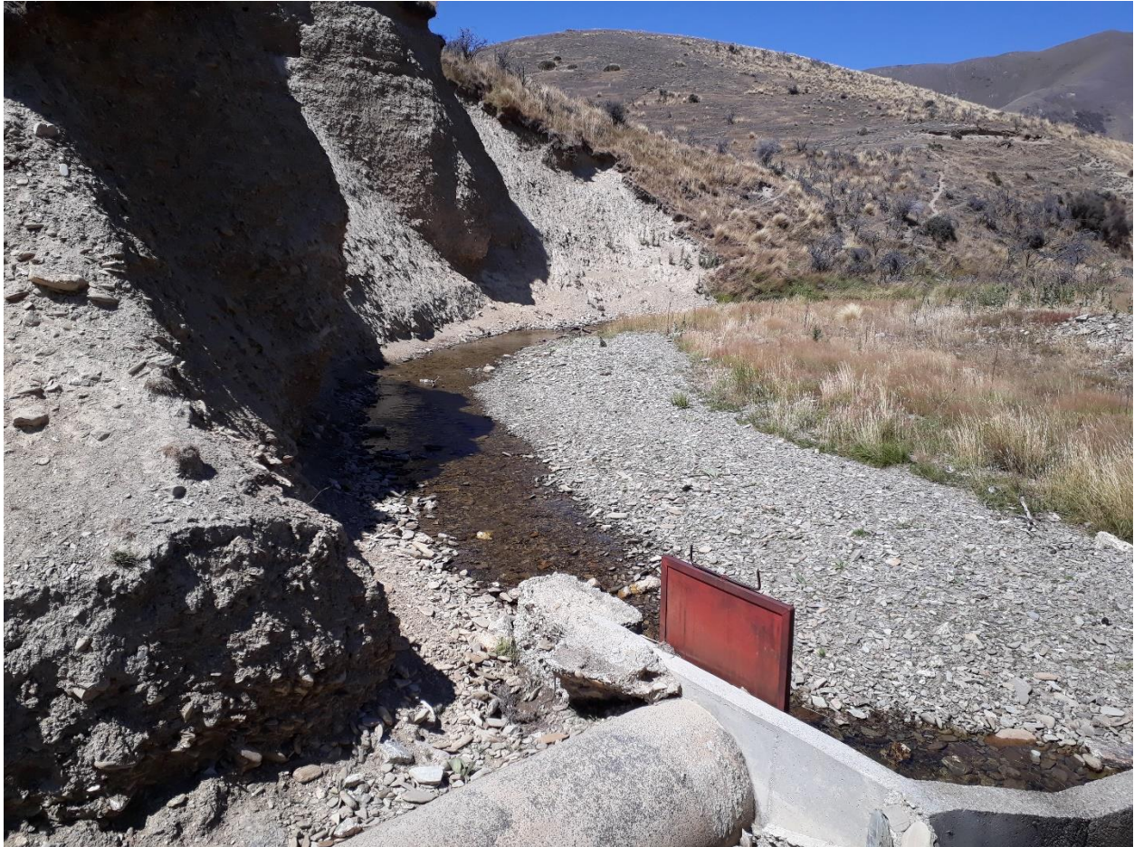
Figure 2. Cluden Stream at the intake.

Originally a residual flow of 5 l/s was proposed at the Cluden take to maintain surface connection. A site visit was carried out on the 31 st of January 2018, this visit confirmed that a residual flow of 5 l/s at the take location maintains surface flow connection and aquatic habitat downstream with a mixture of riffles, runs and pools. Flows were also observed to increase below the take with contributions from springs seeps and groundwater. Figures 2 – 6 provide photos of Cluden stream from the intake to ~700m downstream.