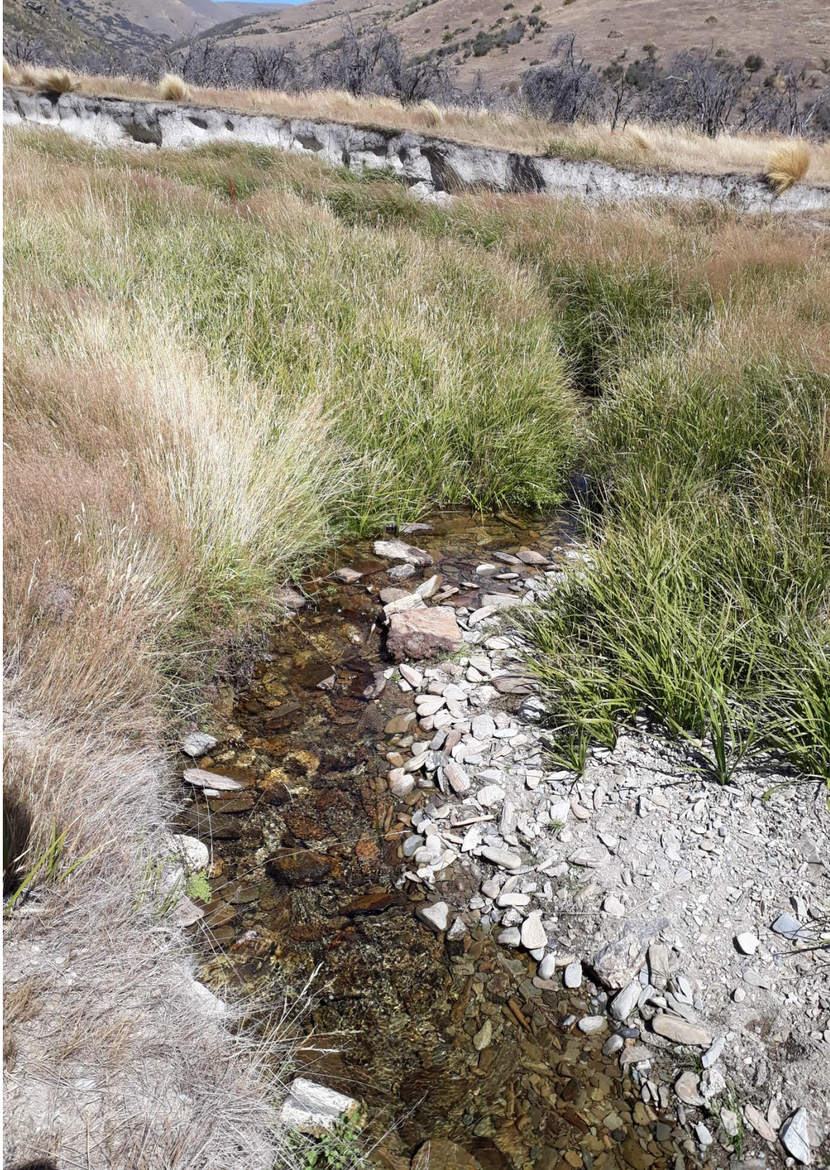
Figure 5. Cluden Stream below intake, ~100m.