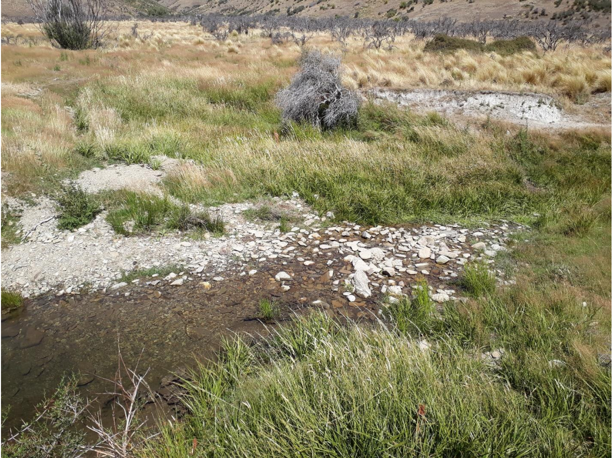
Figure 3. Cluden Stream immediately below the intake. Flow at \sim 5 l/s.