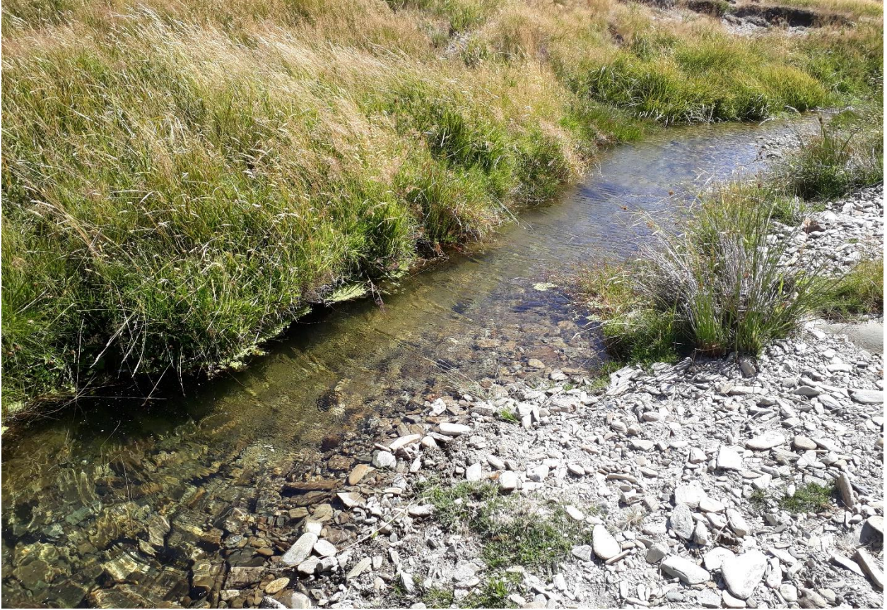
Figure 4. Cluden Stream below intake ~50m.