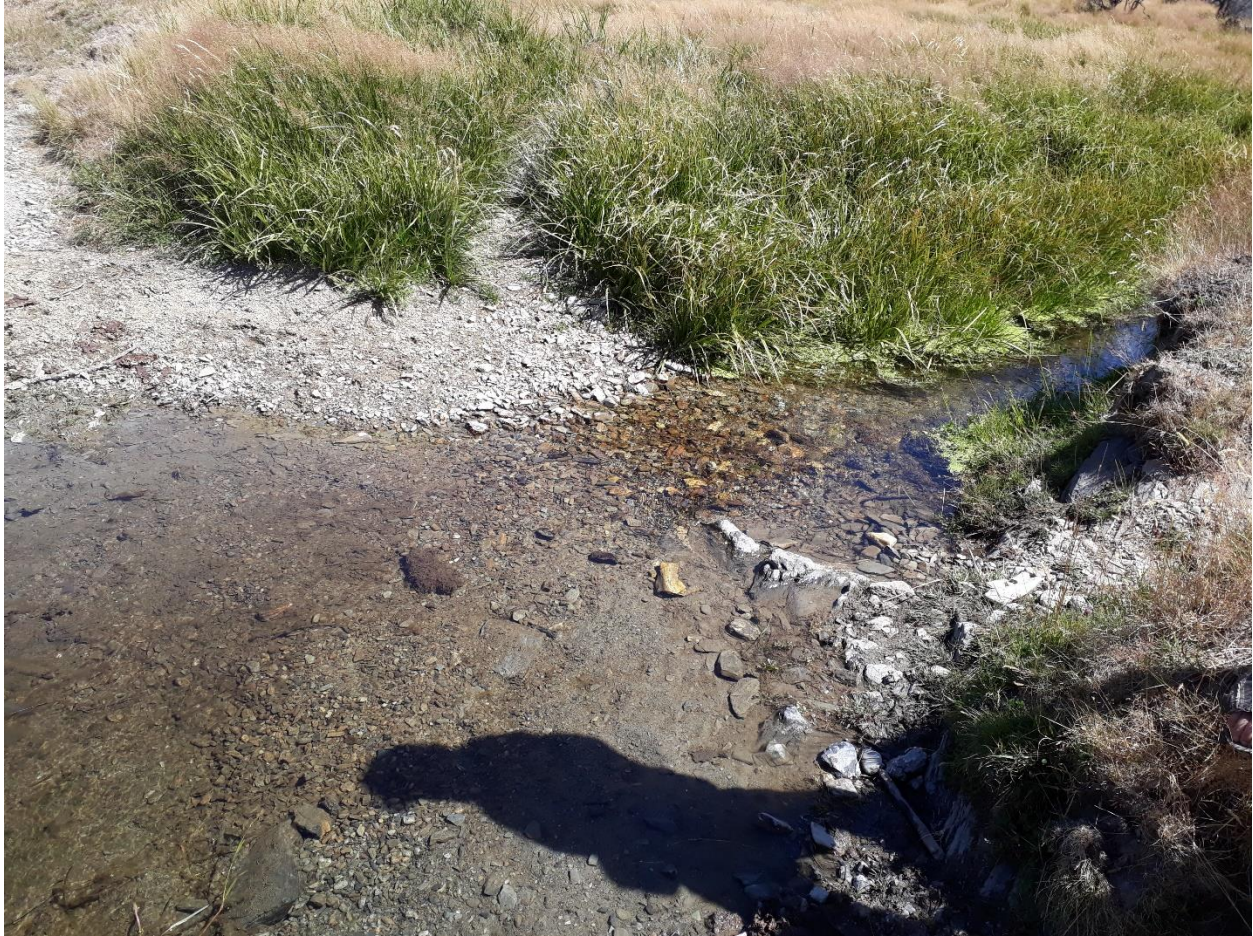
Figure 6. Cluden Stream at Ford ~700m downstream of the take. Flow ~15 l/s.

While on site on the 31 st of January 2018 it was noted that there were no young of the year (0+) trout observed below the take although the water was clear and visibility excellent. 0+ trout are prolific in the lower Cluden Stream at this time of year. Given the lack of 0+ trout F&G staff queried whether large adult trout from the Lindis River are able to access the upper reaches of Cluden Stream. In September both Daniel Jack (DoC) and myself observed what appears to be a significant waterfall in the upper Cluden, some 11 km's above the Lindis confluence (Figure 7 & Figure 8). Given the lack of 0+ trout below the intake and in considering the downstream waterfall it is unlikely that adult trout from the Clutha or Lindis are able to access the upper reaches of Cluden Stream to spawn.