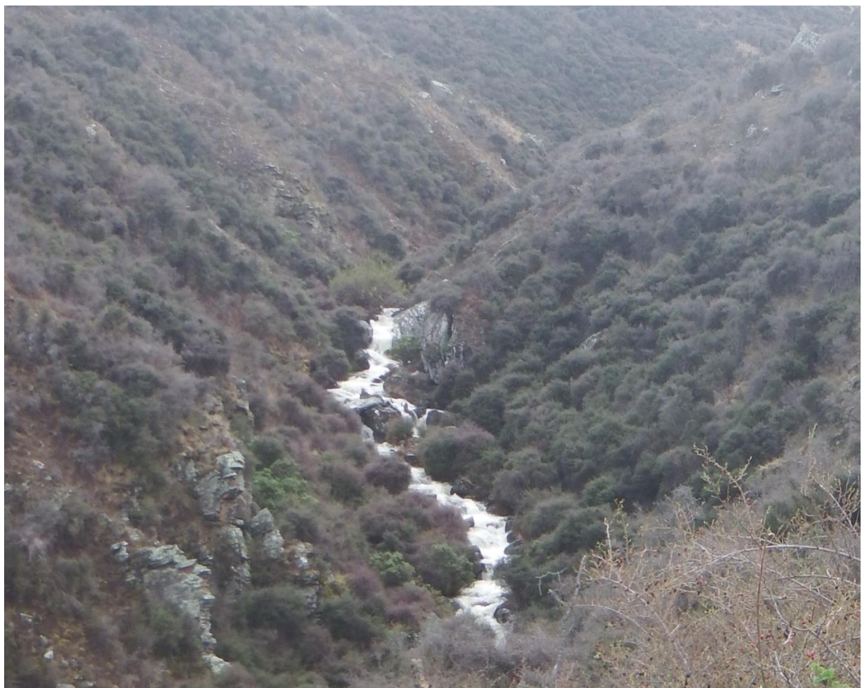
Figure 8. Waterfall in Cluden Stream 11 Km's upstream of the Lindis confluence. Photo taken in Sept 2017.