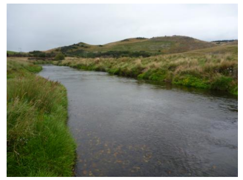
Catlins River at Houipapa