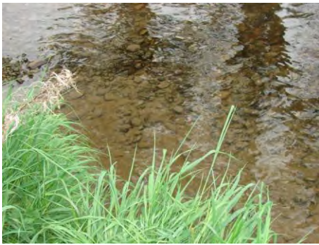
Owaka mid – fine sediment

Most of the sites sampled had substrate in good to excellent condition and showed a very similar substrate composition (with the exception of the Owaka upper and mid sites). The Owaka sites contained a greater proportion of bedrock, the presence of which generally restricts the available habitat for fish and macroinvertebrates.