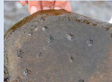
Stoneflies in the Maclennan