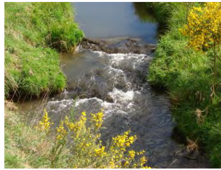
Owaka upper – bedrock

The sites with more than 20% fine sediment cover were the Owaka sites and the Tahakopa mid-site. Even though the Owaka sites were dominated by bedrock, this fine sediment was visible in areas where bedrock was absent..