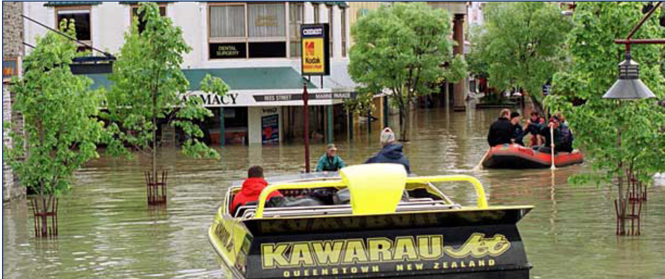
1999 Flood outside Wilkinson's Pharmacy