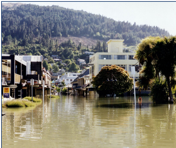
1999 Flood, Beach St