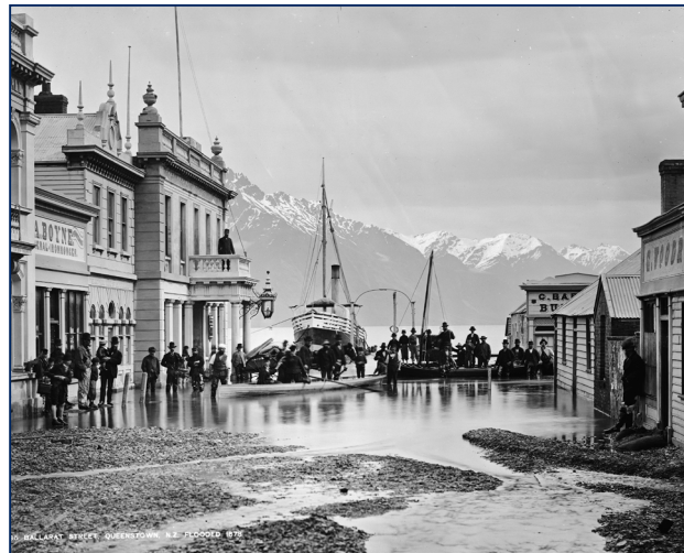
1878 Flood - 35 Ballarat St, Queenstown