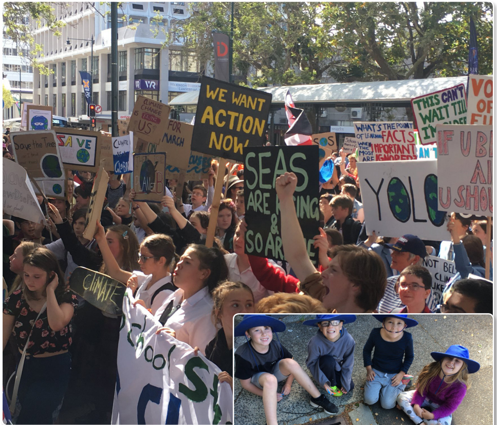
Dunedin student climate strike

Otago Girls High School students are thinking big and have applied to the School Gen programme for school solar panels! As they said, "What better place for solar panels than in SUNEDIN!!!! "