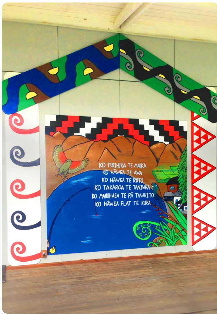
Hawea Flat Primary School's Kowhaiwhai panels and pepeha