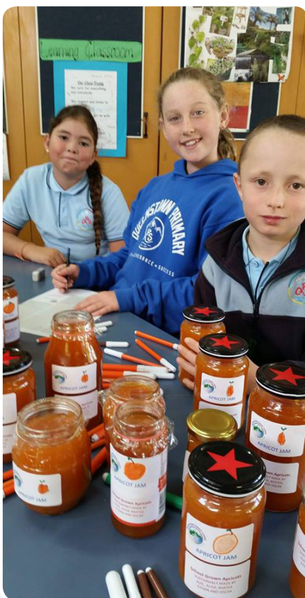
Queenstown Primary students getting their apricot jam ready for market

Clyde Primary students have spent the last two years finding out what lives and grows in their neighbourhood. As well as birds and skinks, they found a lot of predators in their tracking tunnels. The school recently spent a day working together with Enviroschools and whanau to build 65 trap boxes which are now spread around Clyde backyards. The students are continuing their monitoring work to see what impact their trapping is having on predator numbers.