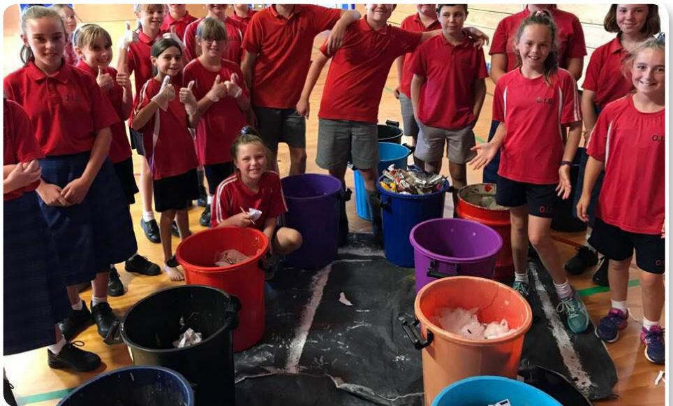
Oamaru Intermediate students with the results of their waste audit

Oamaru Intermediate School have done their first waste audit. The students want to find ways to reduce the amount of waste created at school and make sure as much as possible is being recycled or composted. Waste audits are great for getting students working together as well as gathering, recording and analysing data. Now they know what waste the school is generating, they can