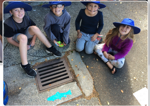
Sawyers Bay students taking up the storm water challenge