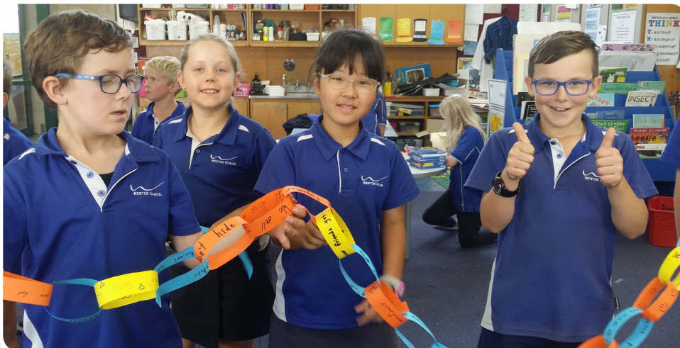
Weston Primary School students with their letters of support for the Oamaru Muslim community

Along with many schools, Weston Primary School , wanted to find a way to support Oamaru's Muslim community in March. The students decided to write messages of support and joined these together in a long chain before giving the chain to the Muslim community.