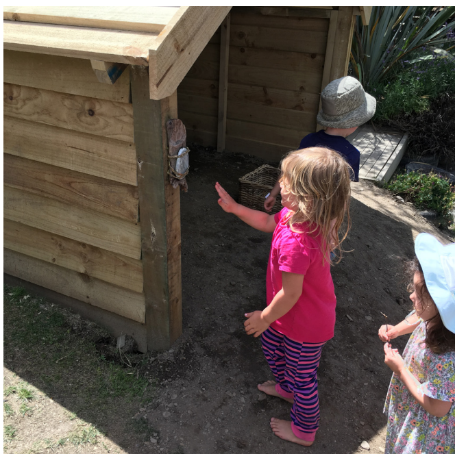
Little Earth Montessori students blessing their whare