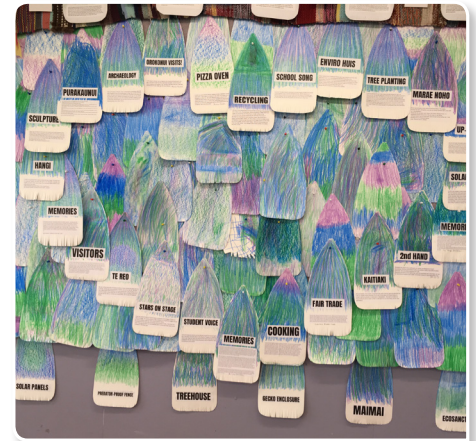
Purakaunui School's kereru cloak telling their sustainability story

Schools recently re-reflected at Bronze and Silver respectively. Re-reflecting is a great option if it has been five or six years since your school last reflected or if there has been high staff turn-over. Tarras Primary School, North East Valley Normal Primary School in Dunedin and Wakatipu High School all reflected at Bronze at the end of 2018. Purakaunui Primary School in Dunedin and Little Earth Montessori in Queenstown both reflected at Green-Gold. Congratulations to everyone involved in these reflections. Get in touch with your facilitator if you want to find out what is involved in the reflection process or to set a date for your school's reflection.