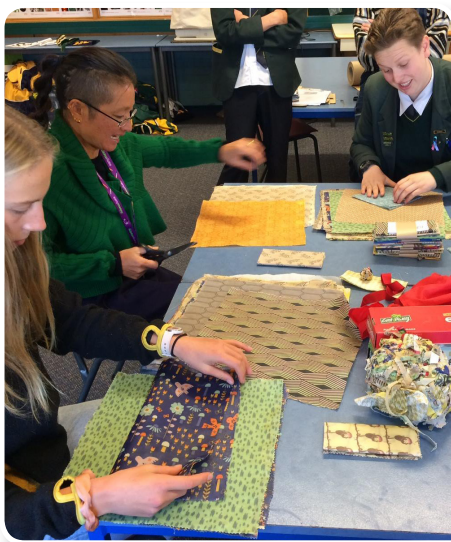
Bayfield High School Envirostudents making beeswax wraps with their key teacher

Lots of schools are getting on board with making beeswax wraps – the 'new gladwrap'. The Envirogroup at Bayfield High School in Dunedin recently had a working bee to make 150 wraps – all of which were pre-sold to school whanau.