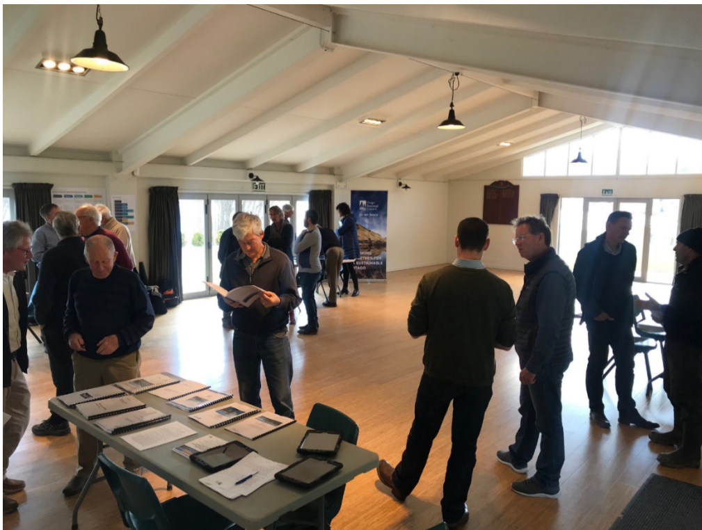
Figure 1: Members of the community attend the first drop-in session (13 August 2019) to discuss with experts the considered intervention options to address the historical accumulation of nutrients in Lake Hayes.