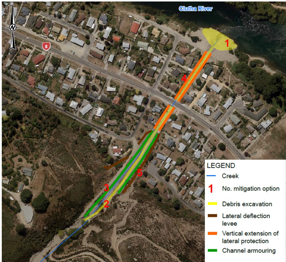
Figure 5: Potential mitigation measures along the lower part of Reservoir Creek (modified from Golder, 2019).