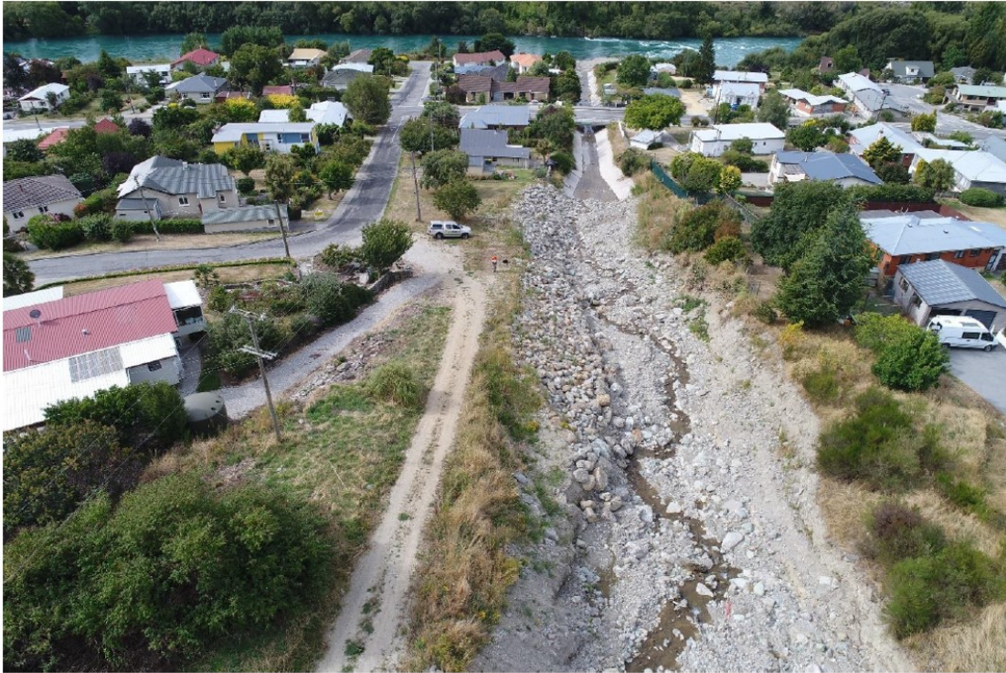
Figure 4: View down Reservoir Creek towards the Clutha River (February 2019). The channel transitions to the concrete flume towards top of image, with the SH8 Bridge visible crossing the flume. View to the east. (Golder, 2019).