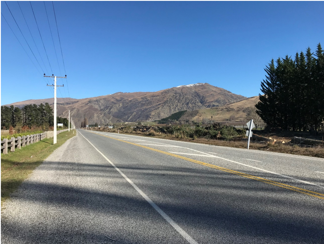
Figure 2: Ripponvale Straight, SH6 near Sandflat Road, Cromwell, looking west (3 September 2019)