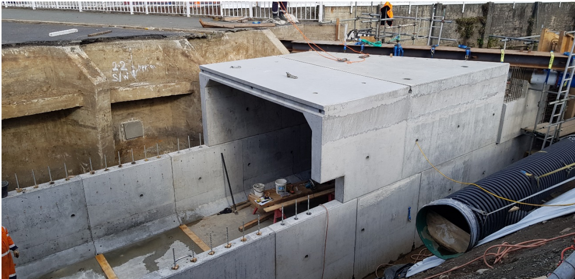
Figure 8: Precast concrete culvert units, Dundas Street bridge (3 September 2019). Dundas Street bridge at top left.