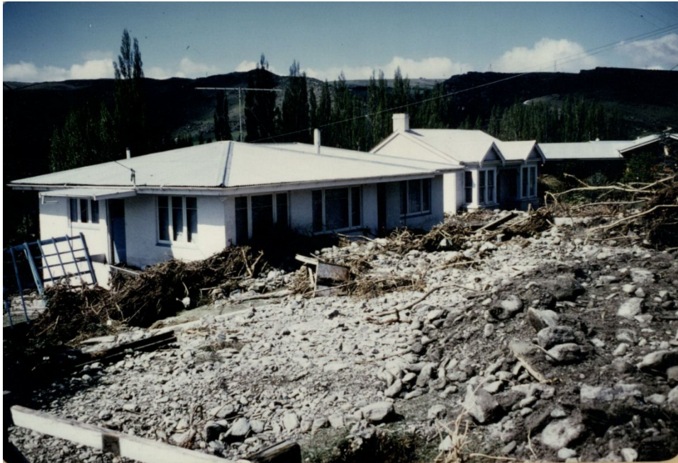
Figure 3: Debris deposited across SH8 at Reservoir Creek in the October 1978 event.