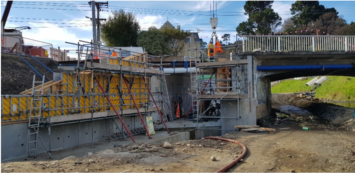
Figure 9: Precast concrete culvert units being craned into position at Dundas Street bridge (3 September 2019).