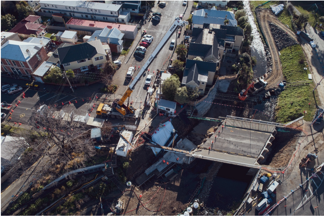
Figure 7: Dundas Street Bridge stage of the Leith Flood Protection Scheme, looking upstream, 6 August 2019