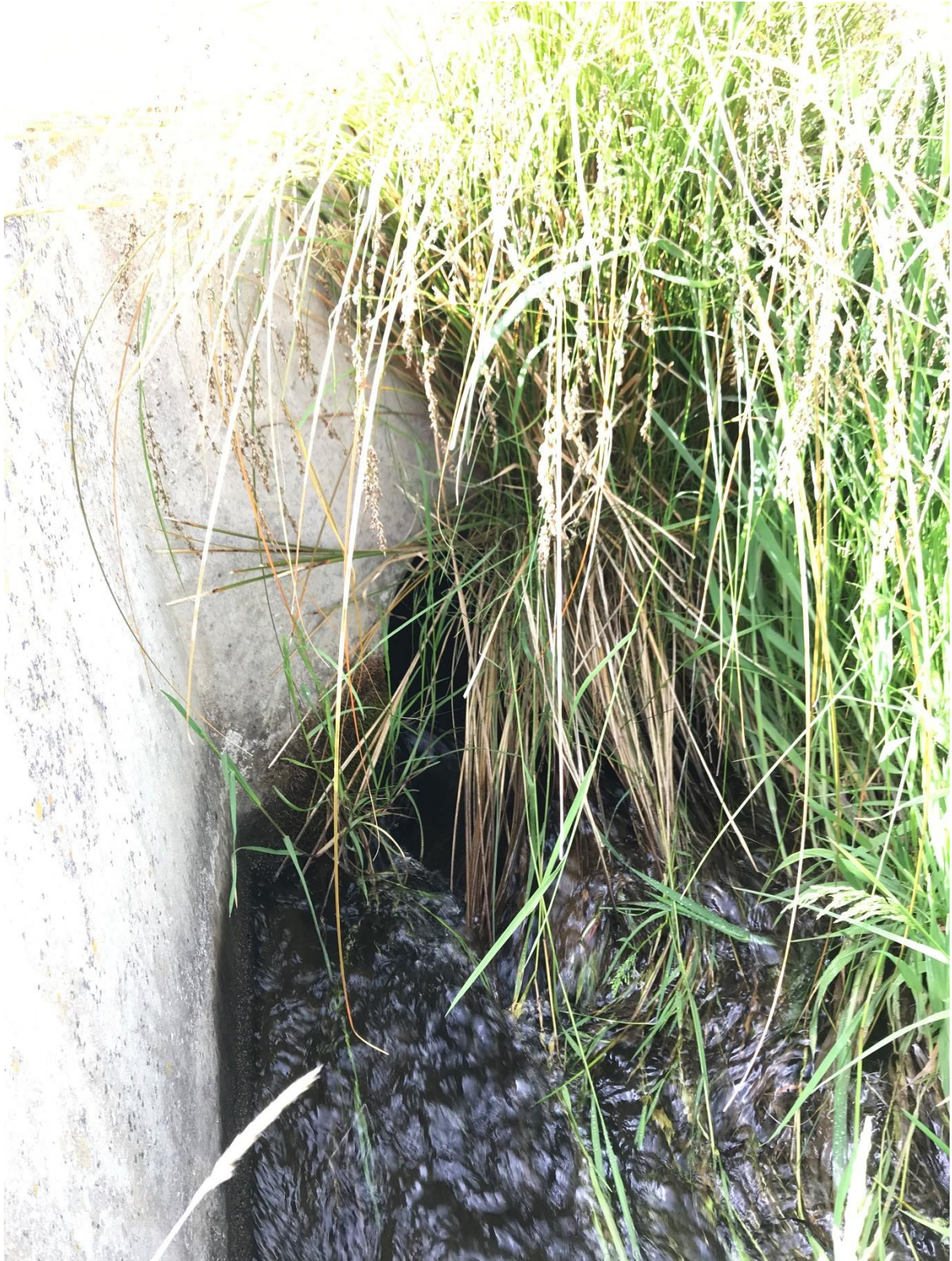
Figure 3: Schoolhouse race SH6 culvert outlet