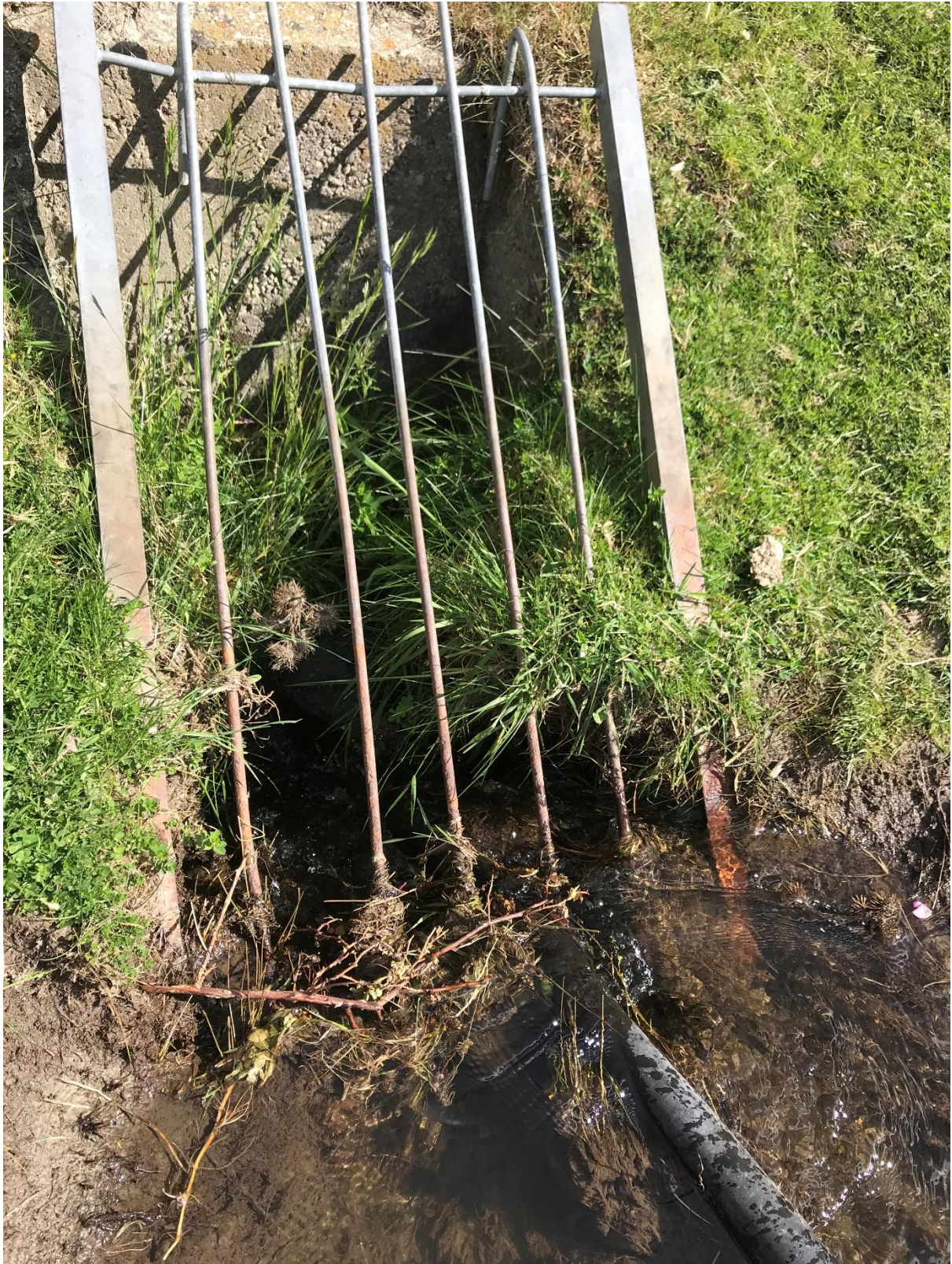
Figure 2: Schoolhouse race SH6 culvert inlet close up. There is a sharp drop just inside the grate, which is difficult to see in the photo.