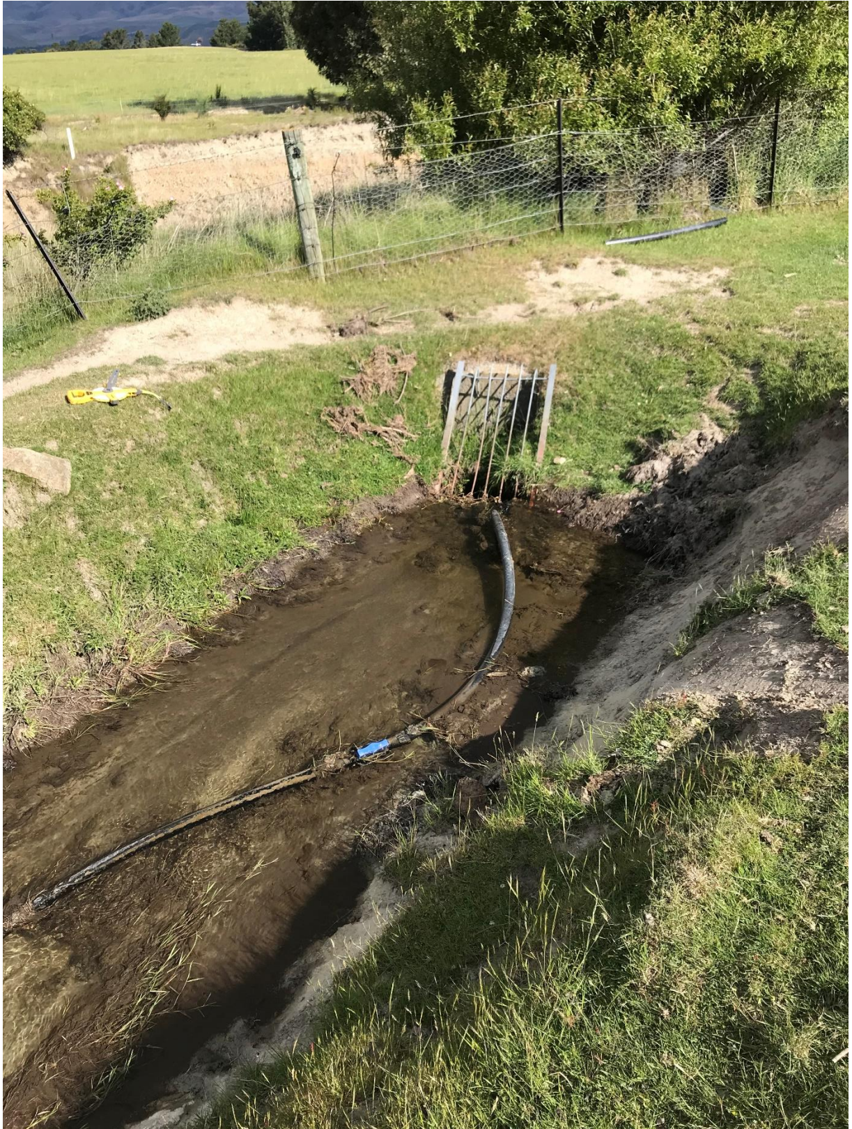
Figure 1: Schoolhouse race SH6 culvert inlet. The pipe shown is a ~50 mm stockwater take