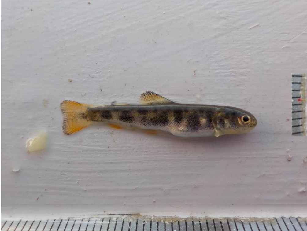
Figure 6: Brook char fry captured late October, approximately 30 mm long, 3 mm high