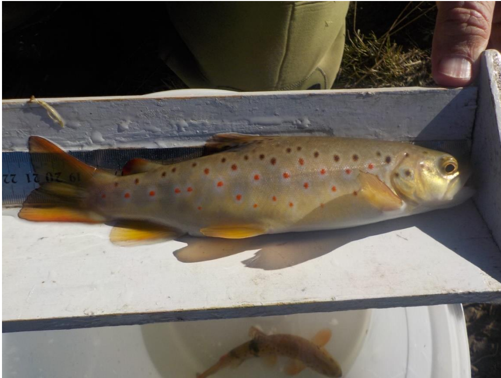
Figure 2: The second largest brown trout caught from the Park Burn.