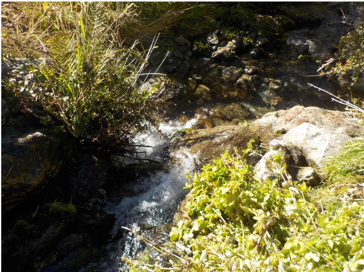
Figure 5: The steep cascade below the upper Amisfield water take.