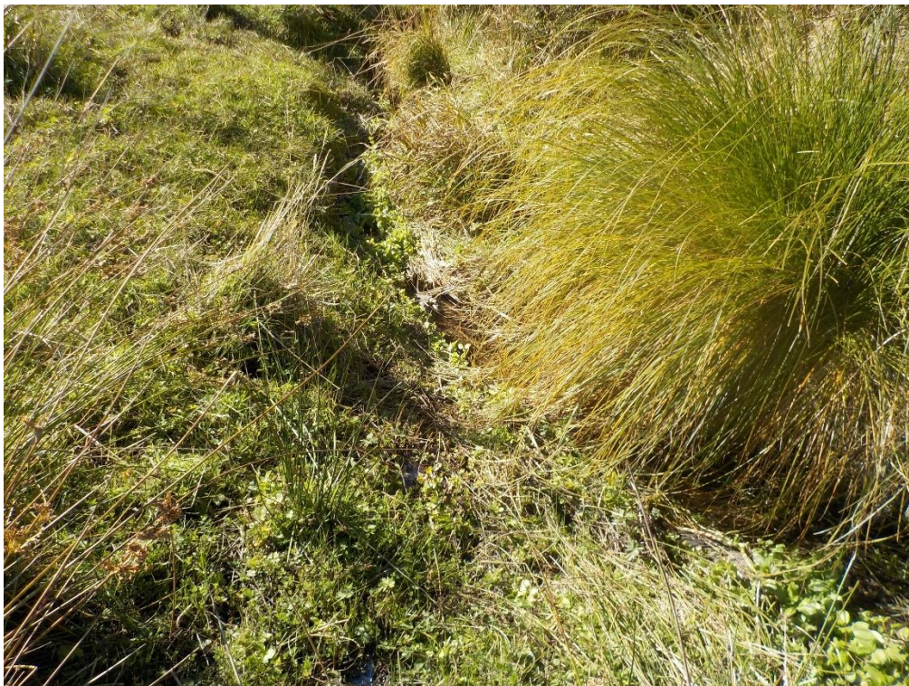
Figure 3. The Park Burn tributary where the fish in Figure 2 was caught.