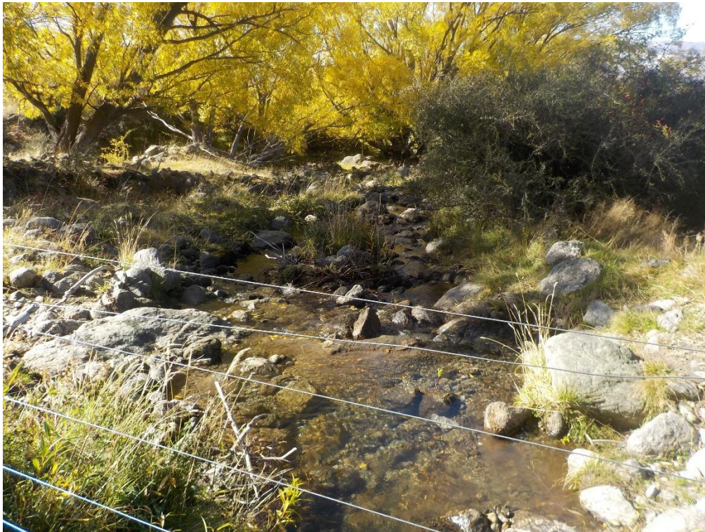
Figure 1. The Park Burn where the largest brown trout was caught.