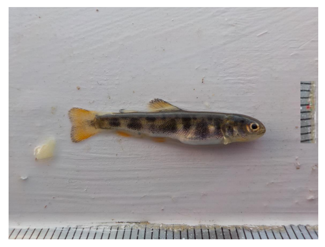
Figure 6: Brook char fry captured late October, approximately 30 mm long, 3 mm high