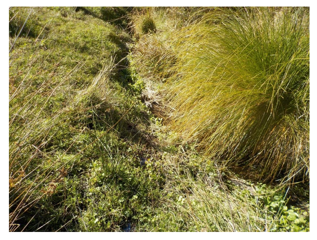
Figure 3. The Park Burn tributary where the fish in Figure 2 was caught.