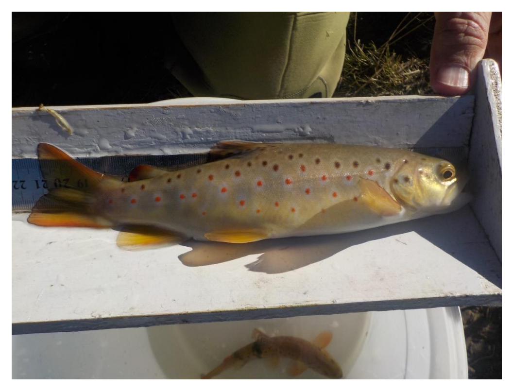
Figure 2: The second largest brown trout caught from the Park Burn.