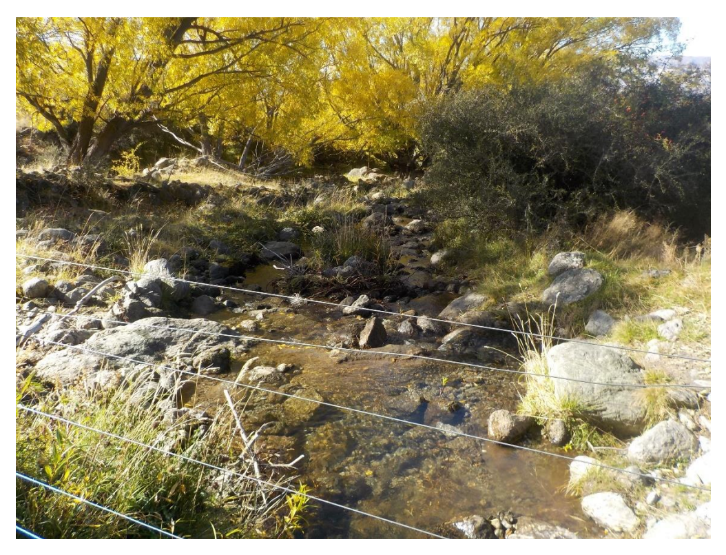
Figure 1. The Park Burn where the largest brown trout was caught.