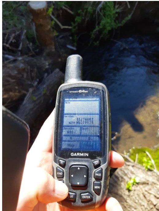
Point of take location 3: NZTM E1274602 N5011075 water abstracted to green tank which supplies dwelling with water