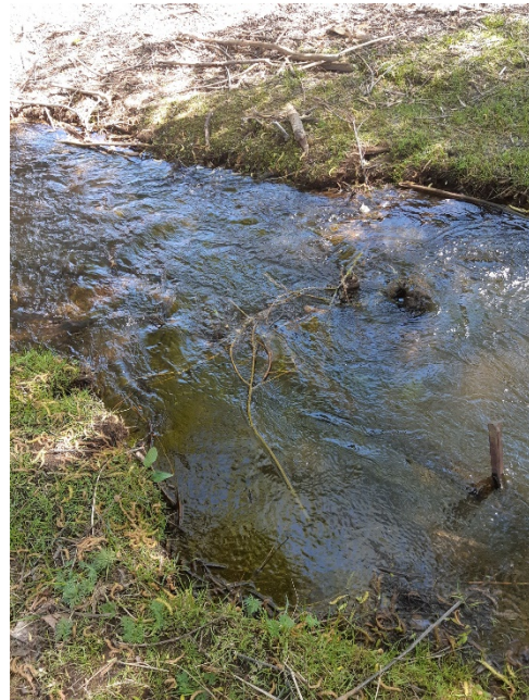
Point of take location 2: NZTM E1274844 N5011424 and waratah in stream demarcating water take