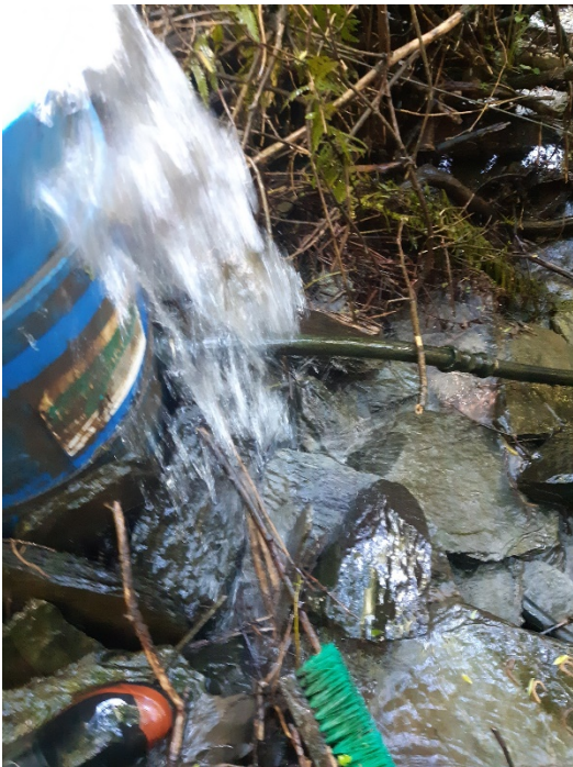
Point of take location 5: NZTM E 1273898 N5010826 supplying property Section 1 SO 23647 with water