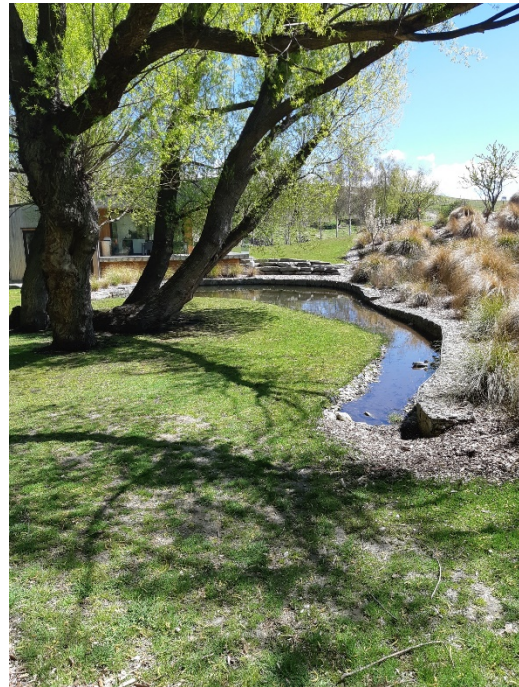
Point of take location 1: NZTM E1274976 N5011533 and ornamental pond water is abstracted to