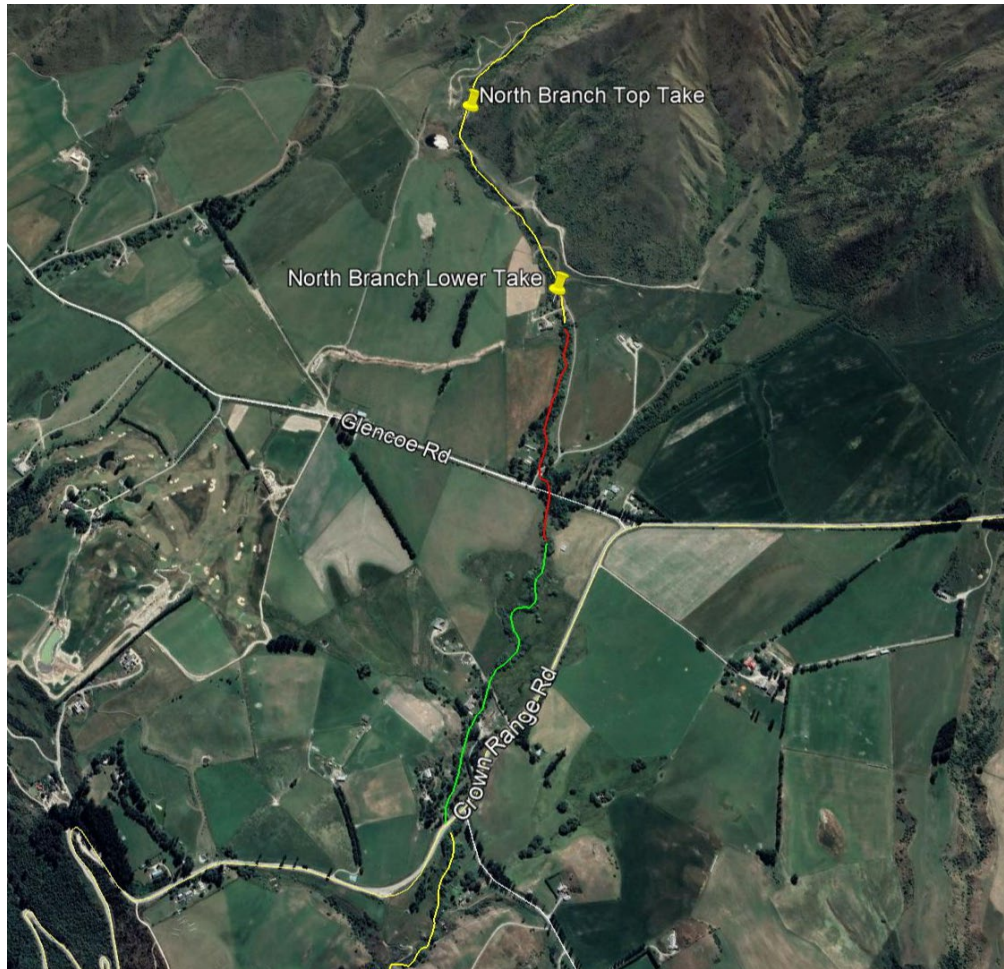
Figure 1. Hydrological Reaches of the Royal Burn. Yellow = permanent flow, red = losing/drying reaches and green = gaining reach.