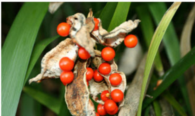
Figure 14. Iris foetidissima - Stinking iris