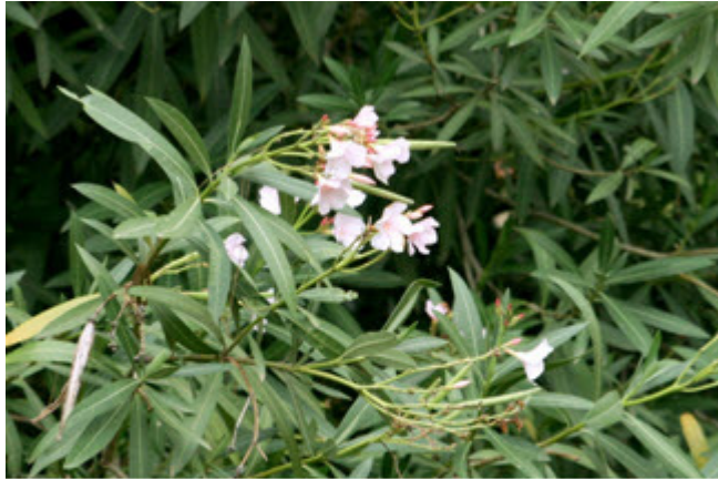
Figure 15. Nerium oleander – Oleander