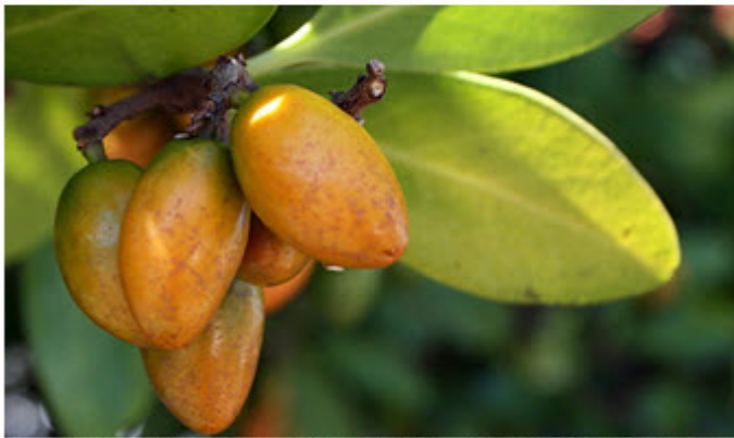
Figure 20. Corynocarpus laevigatus – Karaka

Karakin is most concentrated in the kernel; however, this can be rendered non-toxic by heating to above 100° C for at least 4 to 6 hours. 2, 114 It was a principal source of food for Maori, who prepared it for human consumption by heating then washing the fruit. 115, 116