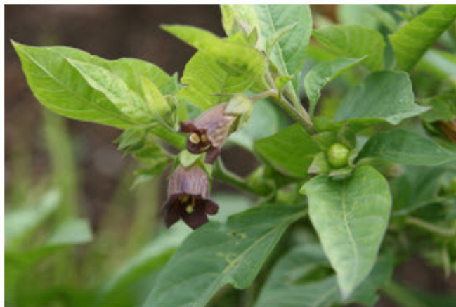
Figure 3. Atropa Belladonna – Deadly nightshade

Interestingly, unripe green berries of black nightshade have also been mistaken for peas and have sometimes been found in frozen vegetables. 3