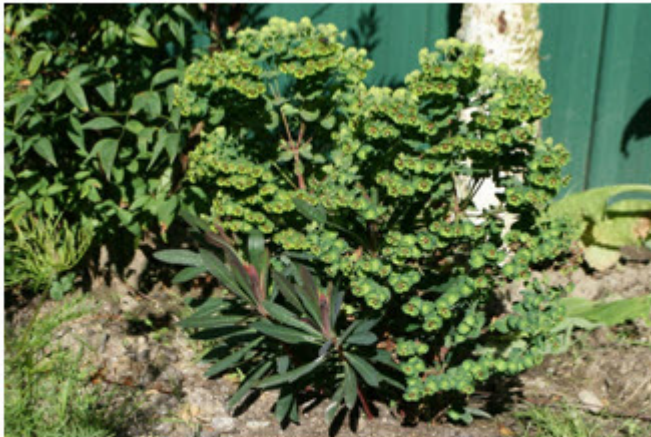
Figure 10. Euphorbia spp. – Euphorbia

Description — Euphorbia is a large genus encompassing about 1600 species. Generally they are annual or perennial herbs or shrubs, typically with flowers in terminal clusters, with alternate or opposite leaves of various shapes and sizes (Figure 10). The most common name for plants in this genus is “spurge”. 15