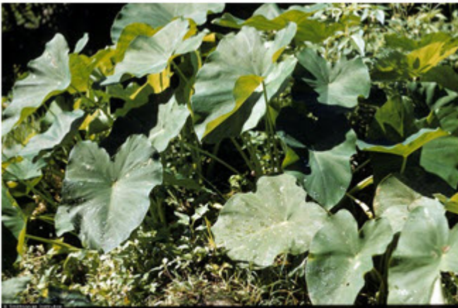
Figure 6. Colocasia esculentum – Taro.