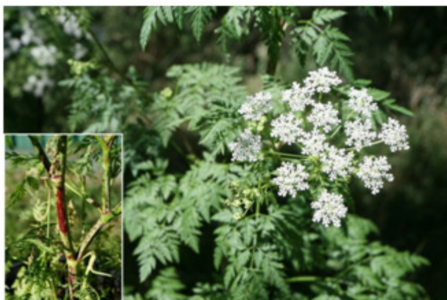
Figure 9. Conium maculatum – Hemlock

Hemlock ( Conium maculatum ) is an annual, biennial, or perennial erect, branched plant which can reach 2 m in height. Growing from a thick yellow or white tap root, the stem is hairless, rigid and hollow with characteristic irregular purple blotches (Figure 9). 41, 42 The leaves are up to 30 cm long, triangular with finely divided leaflets, giving the plant a fernlike appearance. Flowers are white, small (2 mm diameter) and arranged in clusters. Each cluster is 2 to 5 cm in diameter. 41, 42 (Figure 9).