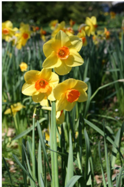
Figure 13. Narcissus spp. – Daffodil