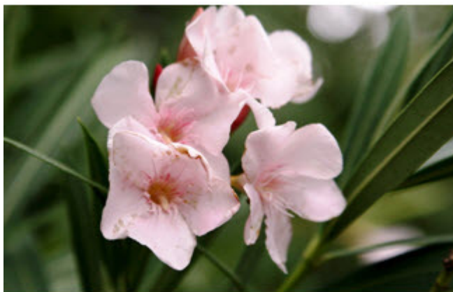
Figure 16. Nerium oleander – Oleander

Foxglove ( Digitalis purpurea ) is a biennial herb; it has an erect flowering stem that grows up to 1.5 m in height (Figure 17). 2, 6 The leaves are arranged in a rosette with each leaf being oval in shape. 6 The tip tapers and the leaves are covered in short, soft hairs, giving a greyish-green appearance. 68 The flowers appear on a single spike, with up to 50 per spike, 68 each flower being up to 4-5 cm in length. 6, 68 The petals are typically purplish pink, but may be white. 42 The inner portion of the petal may have purple or brown spots, with these sometimes being ringed with white 68 (Figure 18).