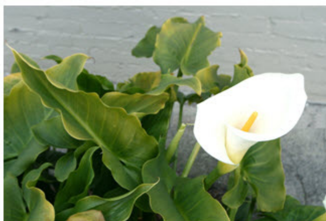
Figure 4. Zantedeschia aethiopica - Arum lily

The arum lily is an evergreen perennial growing up to one metre in height. It has large green leathery arrow-shaped leaves and distinctive white funnel-shaped flowers containing a bright yellow spike 13 (Figure 4). Peace lilies are evergreen perennials with large shiny green leaves and distinctive flowers consisting of a spike (spadix) surrounded by white, yellowish, or greenish leaf-like sheathing bract (spathe) (Figure 5). 14 Taro is a herbaceous perennial growing 1 to 2 metres tall. It has large arrowhead-shaped green leaves on the end of large stalks. 14 (Figure 6). Rhubarb is a herbaceous perennial plant; growing from a thick rhizome, it has large fan-shaped leaves on a long thick reddish leaf stalk. 14 (Figure 7).