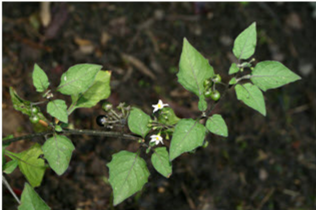
Figure 2. Solanum nigrum - Black nightshade

Unfortunately, black nightshade is often mistaken for deadly nightshade ( Atropa belladonna ) due to the similar common names. 2 True deadly nightshade is extremely rare in New Zealand and the two plants can be easily distinguished as deadly nightshade has large bell-shaped brownish-purple flowers (Figure 3) instead of the star-shaped white flower of black nightshade. The berries of deadly nightshade are also green ripening to black, but are larger. 2