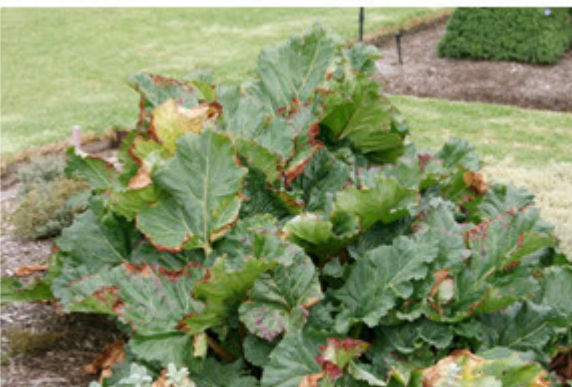
Figure 7. Rheum rhabarbarum – Rhubarb