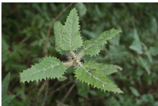
Figure 22. Urtica ferox - Ongaonga/New Zealand tree nettle

Description —Commonly known as ongaonga or New Zealand tree nettle, Urtica ferox is a native species of stinging nettle. 124 It is a shrub which may grow up to 2 m or more in height. It has pale green leaves, 8–12 cm in length, and triangular in shape with coarsely toothed margins.