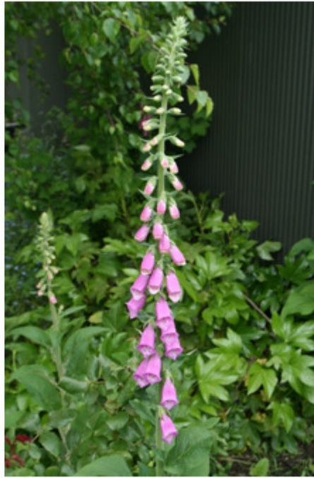
Figure 17. Digitalis purpurea – Foxglove