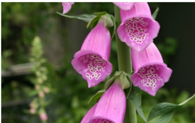
Figure 18. Digitalis purpurea – Foxglove

Mechanism of action —Cardenolides inhibit normal function in the myocardium and cardiac conducting tissue. A major mechanism is their inhibition of membrane-bound sodium-potassium-ATPase, which normally exchanges extracellular potassium for intracellular sodium. 78, 79 Inhibition causes decreased active transport of potassium into, and sodium out of, myocardial cells, producing hyperkalaemia and increased intracellular sodium concentrations. 79 The latter reduces the activity of the sodium-calcium exchange mechanism, which normally transfers calcium out of the cell in exchange for sodium. 78