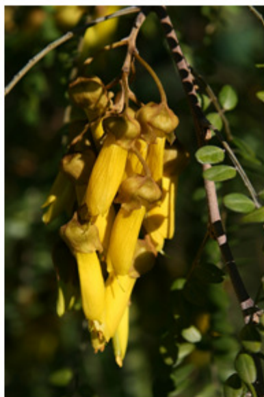
Figure 8. Sophora microphylla – Kowhai

August and October; flowers are yellow and up to 4.5 cm long in 4 to 10 flowered racemes. 2, 40 (Figure 8). They are found in open forests, forest outskirts, along rivers and in open places throughout both the North and South Island. 2, 40