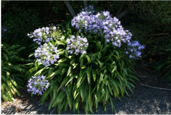
Figure 12. Agapanthus praecox – Agapanthus © Used with permission. Photo Credit: Robin Slaughter.