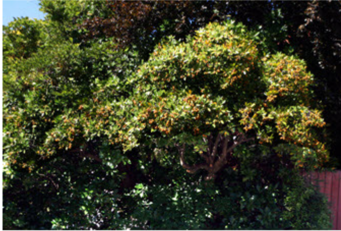
Figure 19. Corynocarpus laevigatus – Karaka