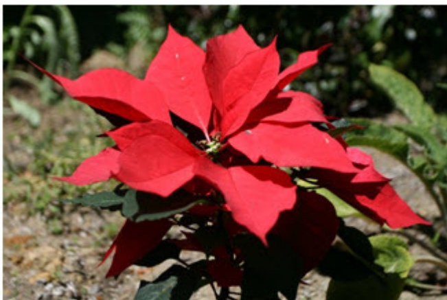
Figure 11. Euphorbia pulcherrima – Poinsettia