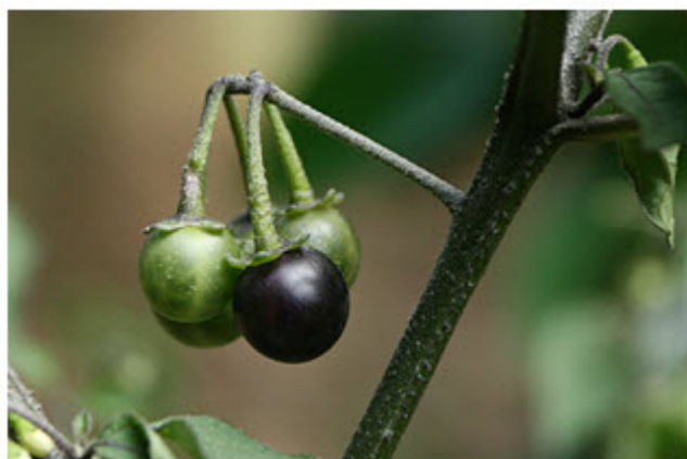
Figure 1. Solanum nigrum - Black nightshade

Description —Black nightshade ( Solanum nigrum ) is a common weed distributed widely throughout New Zealand. 2 The berries are small and round, up to 10 mm in diameter. The fruits are green when unripe, but ripen to a dull black (Figure 1). It has green leaves up to 10 cm long and small white star-shaped flowers with bright yellow anthers 2 (Figure 2).