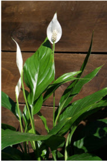
Figure 5. Spathiphyllum spp. - Peace lily